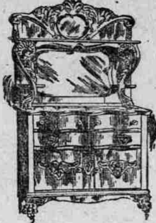
French beveled mirror, beautifully carved top, drawer lined for silverware; regular price $30. Gadsbys' price.....$25.00