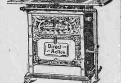
Notice this style has broiler above the oven. The oven fire and broiler fire separate and in plain sight. Price, including connection to your stub.....$31