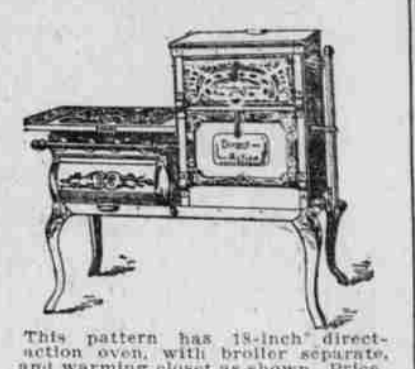
This pattern has 18-inch direct-action oven, with broiler separate, and warming closet as shown. Price, connected to stub.....$50

FIRST —We can prove to your satisfaction that we can reduce your gas bill 25 per cent. SECOND —We absolutely guarantee Direct Action ranges to bake evenly, top and bottom. THIRD —They last longer because they have no oven bottom to burn out, and no flue walls to generate moisture and rust out. FOURTH —They are economical, because you do not heat your oven when you broil or toast—you do not heat the broiler when you bake or roast. Prices $24.00 and $54.00. Easy payments. We have gas stoves as low as $11.00. All Direct Action ranges connected to stub free. Old ranges taken in exchange.