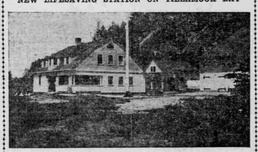
VIEW SHOWING HOME OF THE CREW.

BAY CITY, Or., July 4.—(Special.)—A full crew is now ready for service at the new Tillamook Bay Lifesaving Station, which is located near the entrance to Tillamook Bay, six miles north of Bay City. The buildings were completed several months ago, but the apparatus was only recently installed and the crew signed up for service. The buildings and apparatus are modern in every detail, and the location is an ideal one for such an institution. A reservoir built high up on a mountain supplies the buildings and grounds with pure water and furnishes a strong pressure for irrigating purposes and fire protection. The crew is composed of Captain Robert Farley, Charles Eastland, Robert Tirk, Lionel Goin, Harry Sharp, Howard Todd, Jack Jennings and Charles Bowers. The men are regularly drilled in beach and surf work, and made a splendid showing while rescuing the crew of the three-master schooner Ida Schnauer, which was recently wrecked on Tillamook spit.