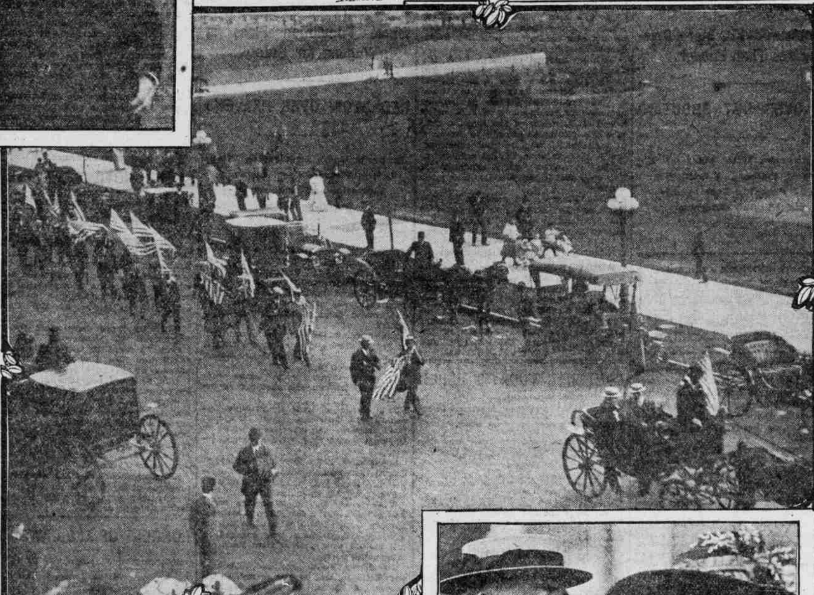
THE MAINE DELEGATION