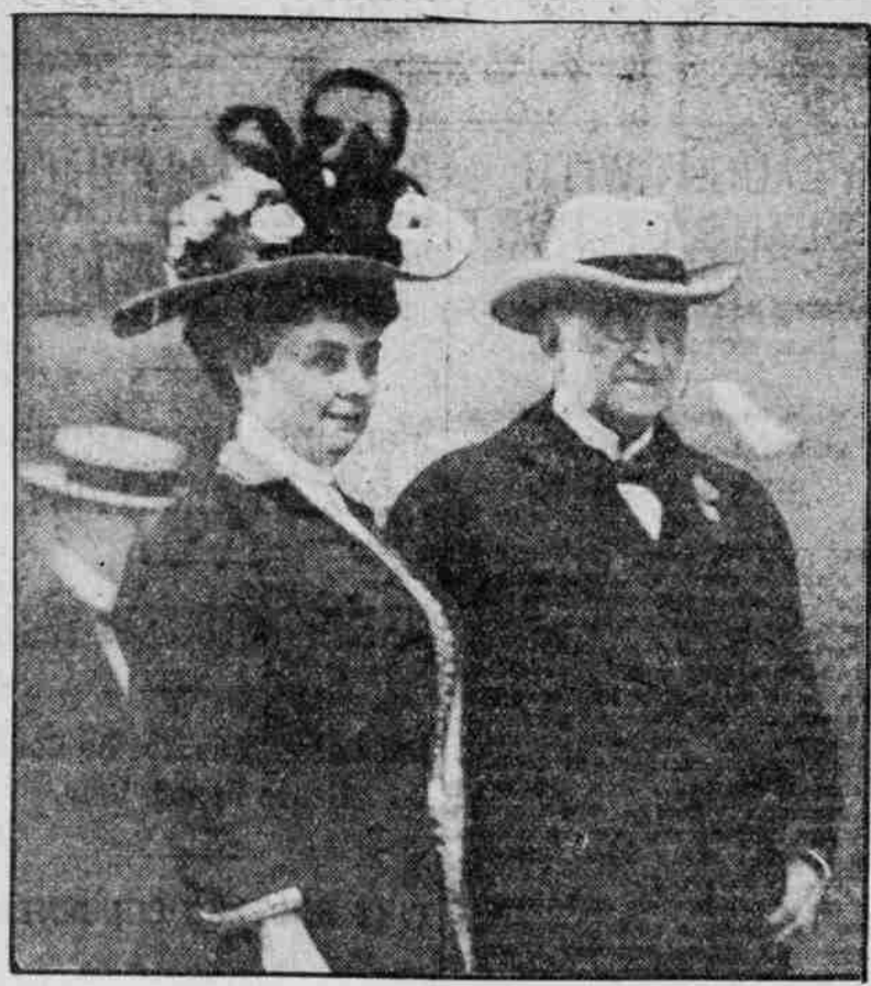
SEN. AND MRS. DEPEW.