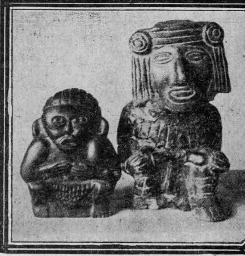
COUNTERFEIT. AZTEC IDOLS