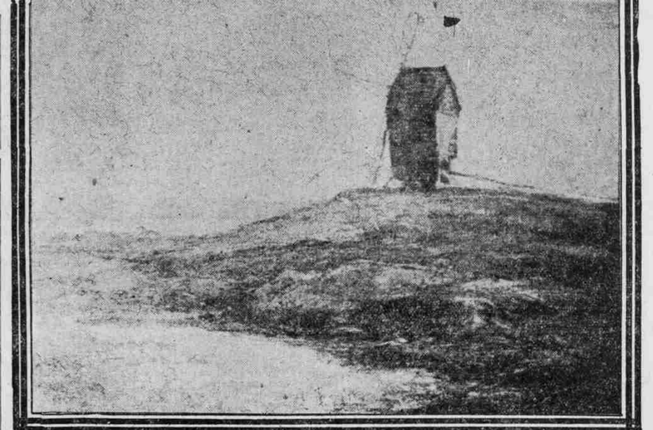
OLD MILL AT ST. CLOUD ALLEGED FORGERY JUST WITHDRAWN FROM NATIONAL GALLERY

Fort Gibbon is reached, below which lie the now well-known Fallsades, dubbed in that region the "boneyard," for from it have been dug broken remnants of many early beasts.