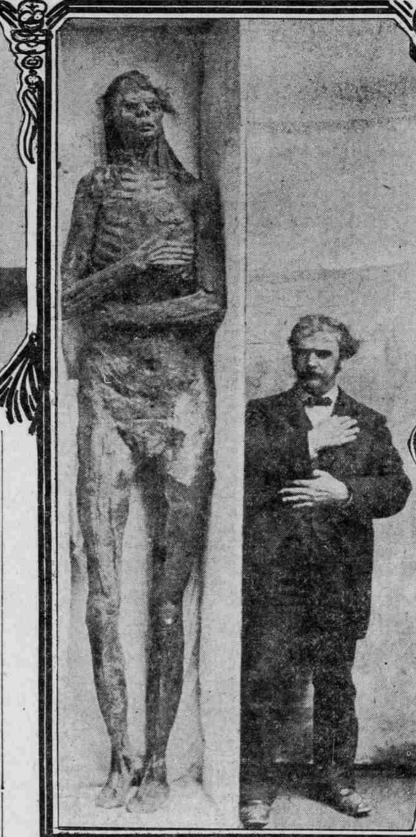
SAN DIEGO GIANT