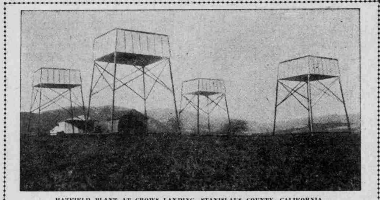
HATFIELD PLANT AT CROWS LANDING, STANISLAUS COUNTY, CALIFORNIA.

LOS ANGELES, June 6.—Five of the sailor victims of yesterday's fatal explosion on board the cruiser Tennessee were buried today in the little Harbor View Cemetery at San Pedro, with full and impressive military honors, and six others, suffering from terrible injuries, were brought to this city before