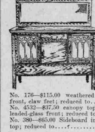
No. 499—$63.00 quarter-sawed oak Buffet, golden finish, three-mirror back, shaped front; reduced to... $36.75