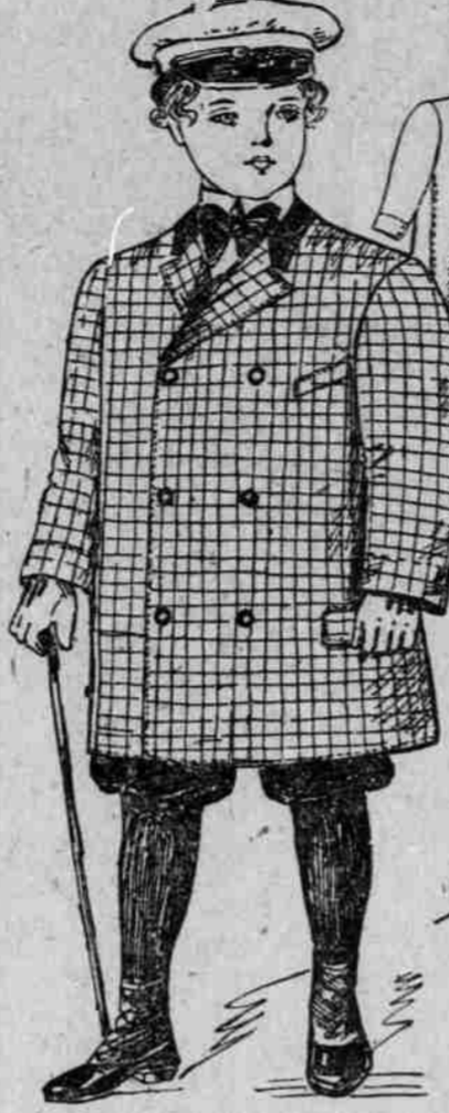
Fig. D—English Worsted Overcoat in Brown and Tan Checks.

FIG. B—NEW CHECKERED EFFECT, IN BLACK AND WHITE WITH SCARLET BELT AND TIE.