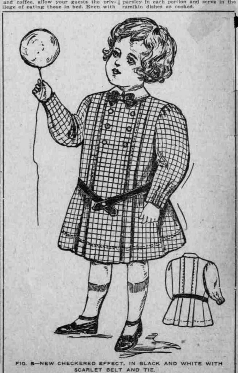
FIG. B—NEW CHECKERED EFFECT, IN BLACK AND WHITE WITH SCARLET BELT AND TIE.