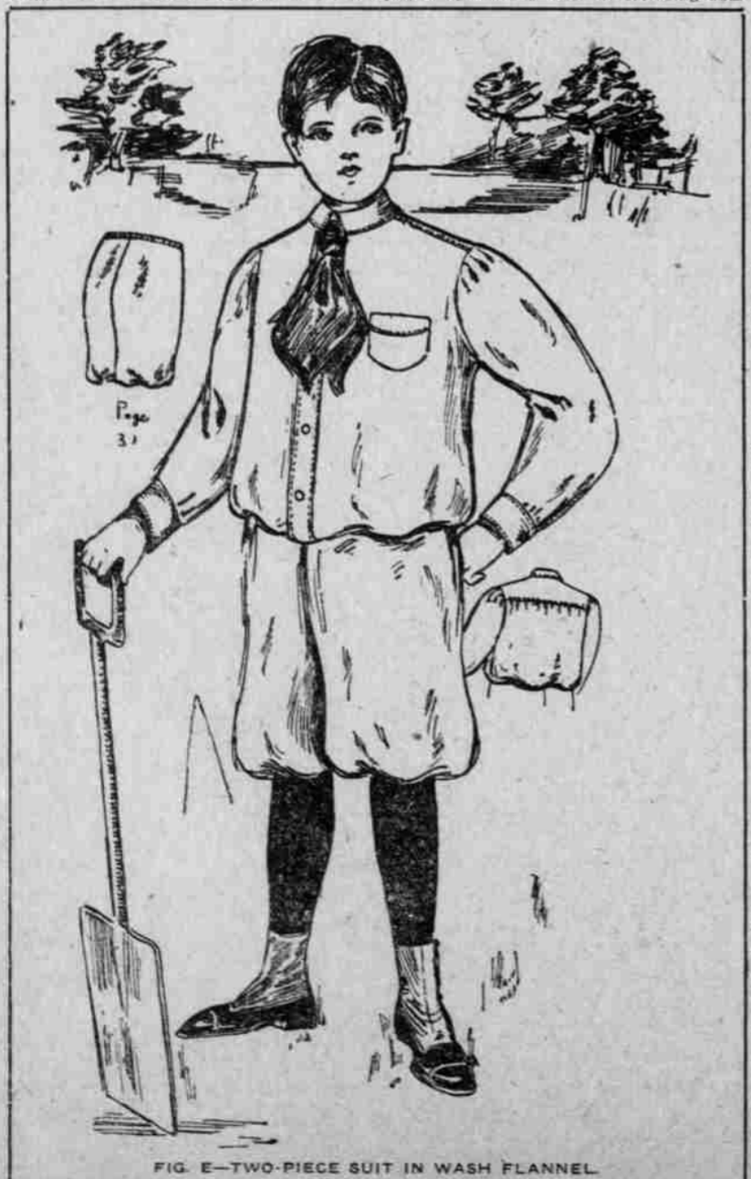
FIG. E—TWO-PIECE SUIT IN WASH FLANNEL.