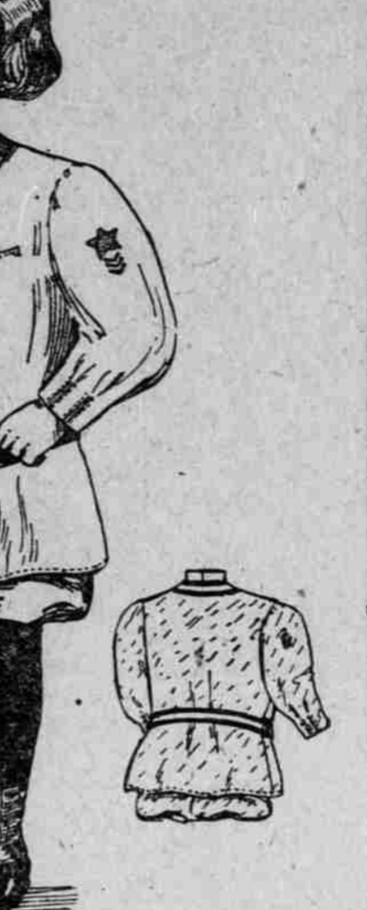
Fig. A—One-Piece Dress in Tan-Colored Holland.