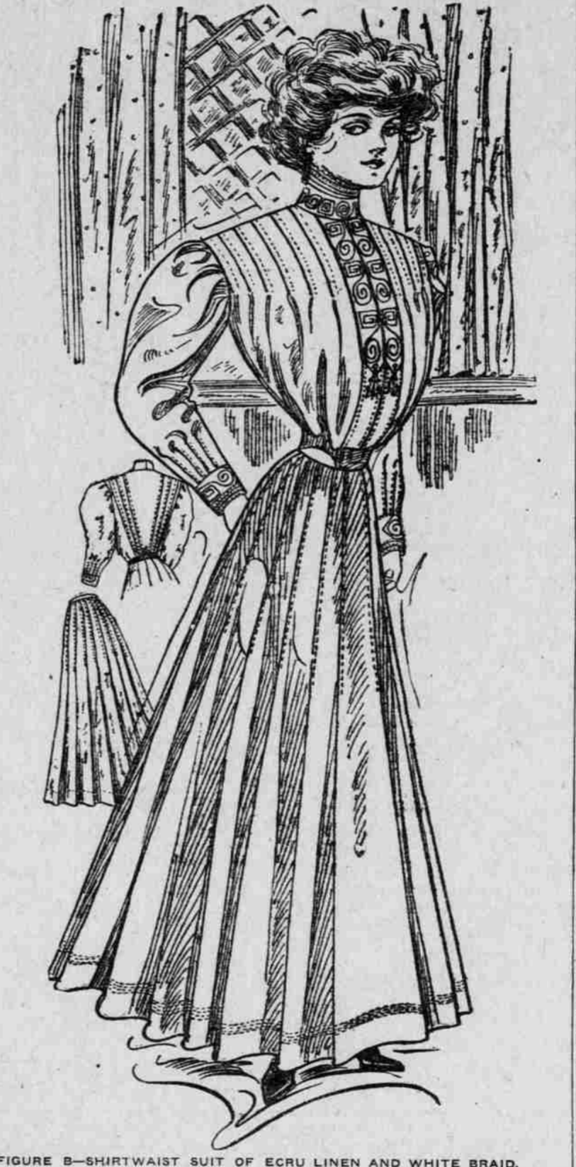
FIGURE B—SHIRTWAIST SUIT OF ECRU LINEN AND WHITE BRAID.

most a misnomer, and the services of a dry-cleaner are more necessary than those of a laundress. While many costumes of plain linen and lawn are noted for both morning and afternoon wear, some stunning effects in fine hair line stripes, dots and other very fancy effects, you will find a woman who invests in a bordered material must expect to patronize the dry-cleaner when her suit needs refreshing. Very few of the tinted borders will really wash. The exception, however, is the white fabric with a single tone striped border, and vice versa, the single tone fabric with white border. For instance, in linen you will find a white ground with a border of navy blue in bands of graduated width, or in pale blue lawn you will see a border made of diamonds in pure white. These bordered tub fabrics come in dress lengths of 12 yards each and the border appears about 48 or 47 inches apart, which for a short woman will admit of a princess effect. The preferred trimming for tailored linen suits is braid and buttons. For