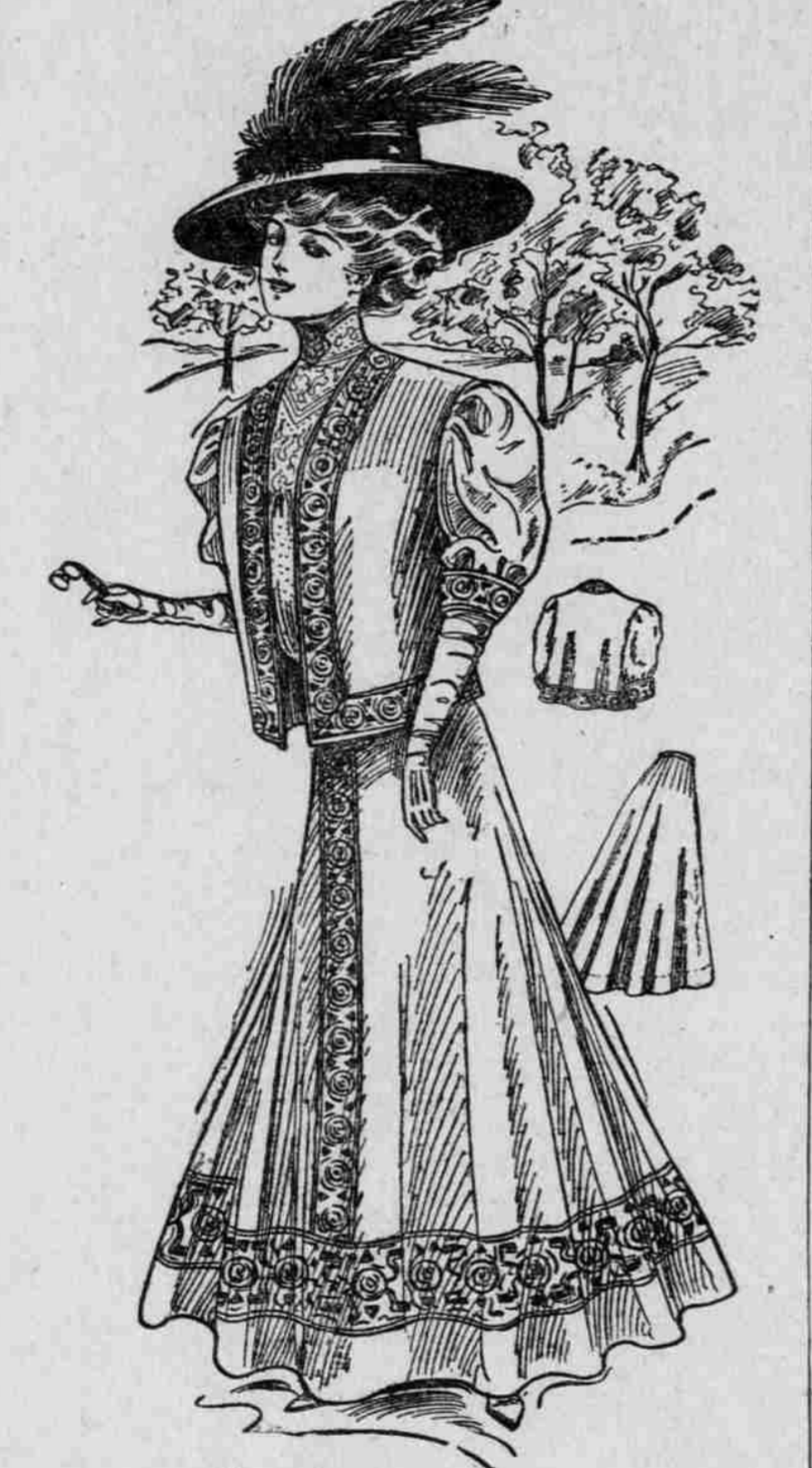
FIGURE A—SUIT IN COPENHAGEN BLUE LINEN WITH EMBROIDERED AND BRAIDED BODICE.

The bretelles can either be sewed tightly under the outside tucks of the blouse or they can be simply beated into lace and removed when the waist is laundered. The latter is by far the best method, as the iron's point can then get well into the gathers of the sleeves. The model in which this pattern was employed combined grayish blue and white check with only a hair line of the white, and trimmings of plain blue with large buttons