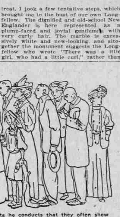
He so dominates the group of tourists he conducts that they often show signs of almost human intelligence.

missed both; but the Abbey, with an almost perceptible nod of invitation, compelled me to turn that way, and involuntarily, though not at all unwillingly. Whereupon I made the startling discovery that I was in the Poets' Corner! Now, I had definitely planned that if ever I did visit the Abbey, I would enter by the North Transept, and gradually accustom myself to the atmosphere of the place. I would go away after a short inspection and return several times to visit it, before I even approached the Poets' Corner. And to find myself thus unexpectedly and somewhat informally introduced to an inscription attesting the rarity of Ben Jonson, took me unawares, and my eyes rested coldly on the words, and then passed on, still uninterestedly, to Spencer, Milton and Gray.