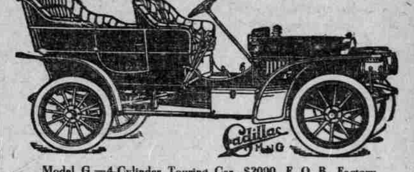
Model G.—4-Cylinder Touring Car, $2000, F. O. B. Factory

Do you realize that this question is being asked wherever automobiles are being sold? Do you realize that the new test and the true test of automobile construction is: "How long will this car last?" Do you know that buyers are pointing to the experience of 16,000 Cadillac owners and demanding to know why other cars do not last as long? Do you know that they are no longer satisfied with mere speed, but want the long life of the Cadillac as well? The Cadillac Company began preparing for this change in the public demand the first year of its existence. It insisted then that no car could last more than a butterfly life which was not synchronized in every essential part—down to one one-thousandth of an inch if need be. It insisted that no such perfect fit and balance could possibly be secured in any assembled car. It insisted that nothing short of the enormous expenditure for special machinery represented in the Cadillac plant could build a car which, like the Cadillac, would keep going continuously. The Cadillac Company proved that this was true by building 16,000 cars which have never gone out of commission; and it is proving it again by building a 4-cylinder car which has no equal in the world for endurance and long life. All these points which are vital to you as a possible buyer we can only hint at here. But mark our words—the day of the one-season car has gone, and the day of the long-lived car has come with the Cadillac. Get the full facts from your Cadillac dealer.