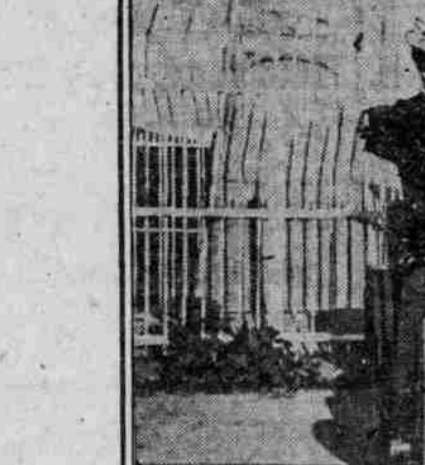
STARTING PLACE INTERNATIONAL MONUMENT BETWEEN MEXICO AND U.S. AT TIA JUANA, MEXICO