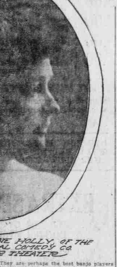
GRAND'S VAUDEVILLE ACTS