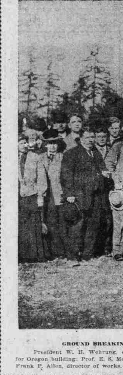
GROUND BREAKING CEREMONIES FOR OREGON BUILDING AT ALASKA-YUKON-PACIFIC EXPOSITION, SEATTLE.

ROME, March 21.—The following explanation of the present situation with regard to the reported engagement of