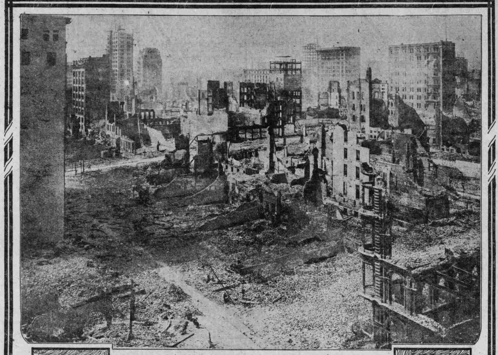
LOOKING SOUTH FROM THE TOP OF MERCHANTS EXCHANGE BUILDING—SAN FRANCISCO MAY 1, 1906

In the Heart of the Business District of San Francisco Showing the Prodigious Work of Rebuilding