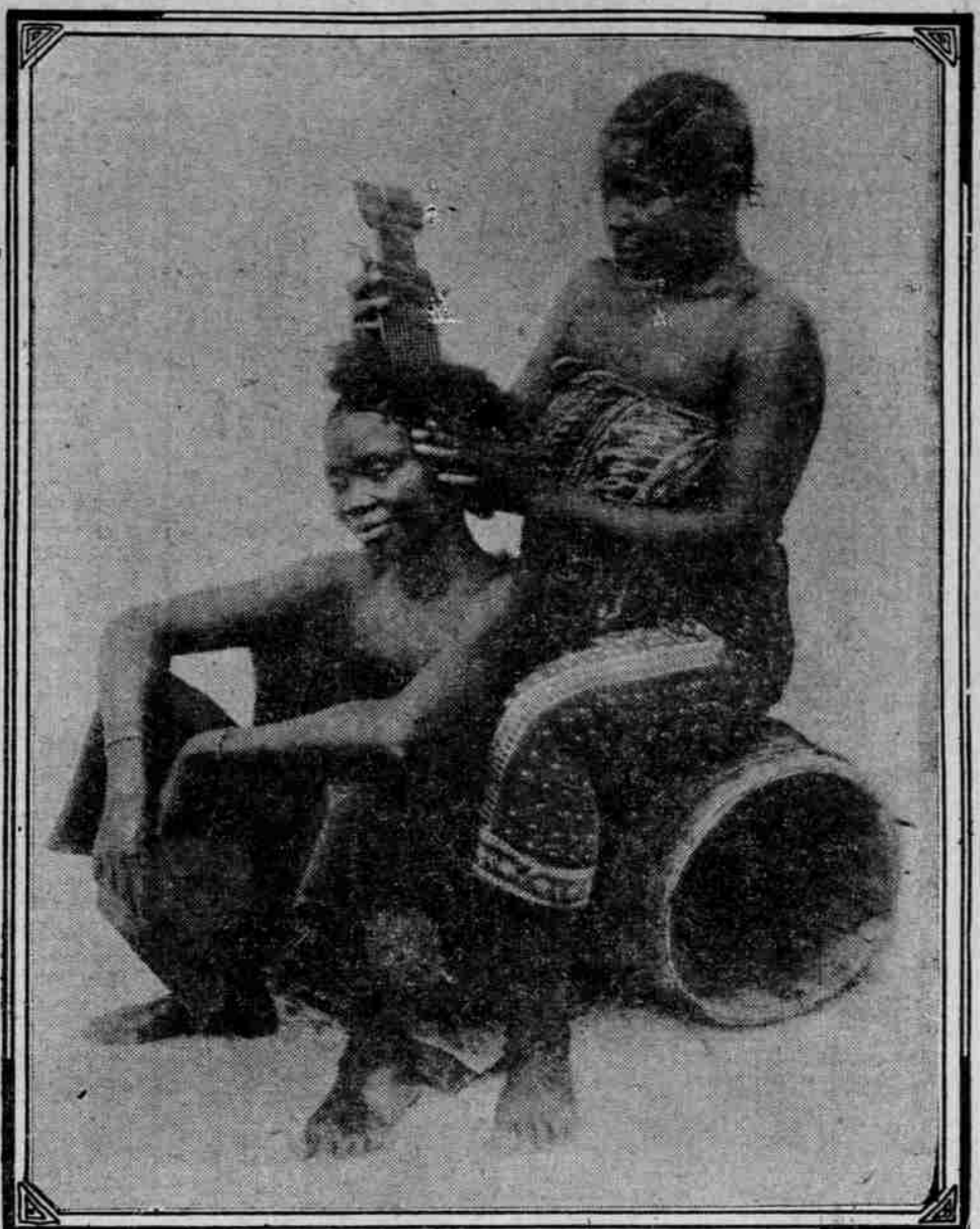
"I TOOK A SNAP-SHOT OF TWO GIRLS UNDERGOING THE PROCESS OF HAIR-DRESSING"

The most numerous of the natives here are the Swahilis. These are of a mixed breed which is found all along the central coast of East Africa. It is said to have some Arab blood in it, and for this reason perhaps its people are brighter and more businesslike than the ordinary native. The Swahilis