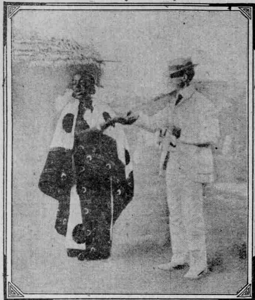
"I GAVE HER A FEW COPPERS TO POSE"

Europe is Swallowing the Continent Inhabited by a Very Curious People