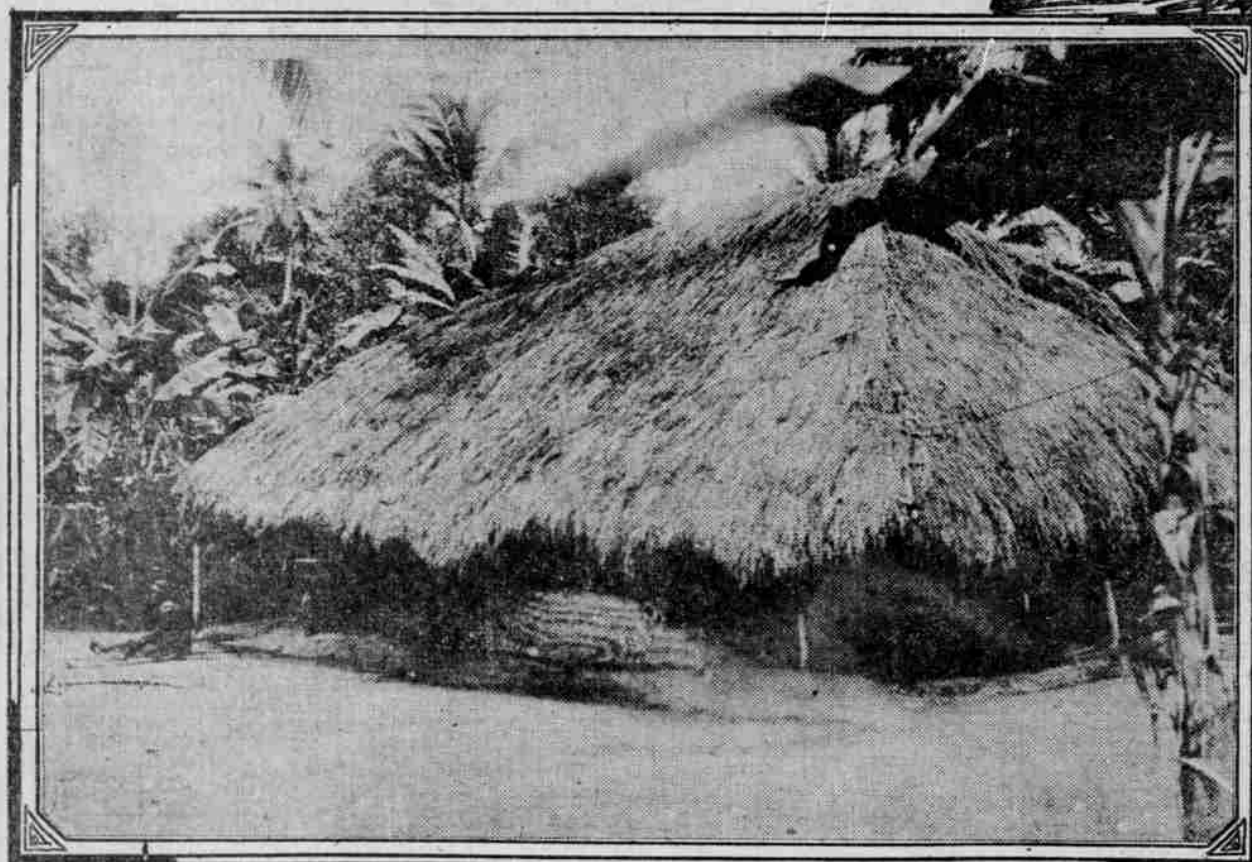
A SWAHILI HUT. THE HOUSES ARE OF MUD, THATCHED WITH STRAW

BY FRANK G. CARPENTER. HAVE left the rocky desert of Arabia and am now on the Island of Mombasa, half way down the coast of East Africa, and just below the equator, where old mother earth is widest and thickest. If I should stick a pin in the old lady's waist, and go westward in a straight line I would soon reach the upper end of Lake Tanganyika, and a little later would come out on the Atlantic just above the mouth of the Congo. Crossing that great ocean, my next landing place would be South America, at the mouth of the Amazon, and, going up the Amazon valley, I should pass Quito, in Ecuador, on my way to the Pacific. From there on, the trip to the pin stuck in at Mombasa would comprise 15 or more thousand miles of water travel. I should cross the Pacific and Indian oceans, and the only solid ground on the way would be the islands of New Guinea, Borneo and Sumatra.