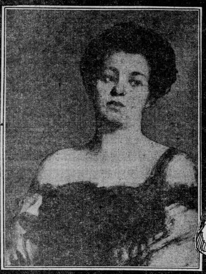
PORTRAIT STUDY, OIL GEORGINA BURNS