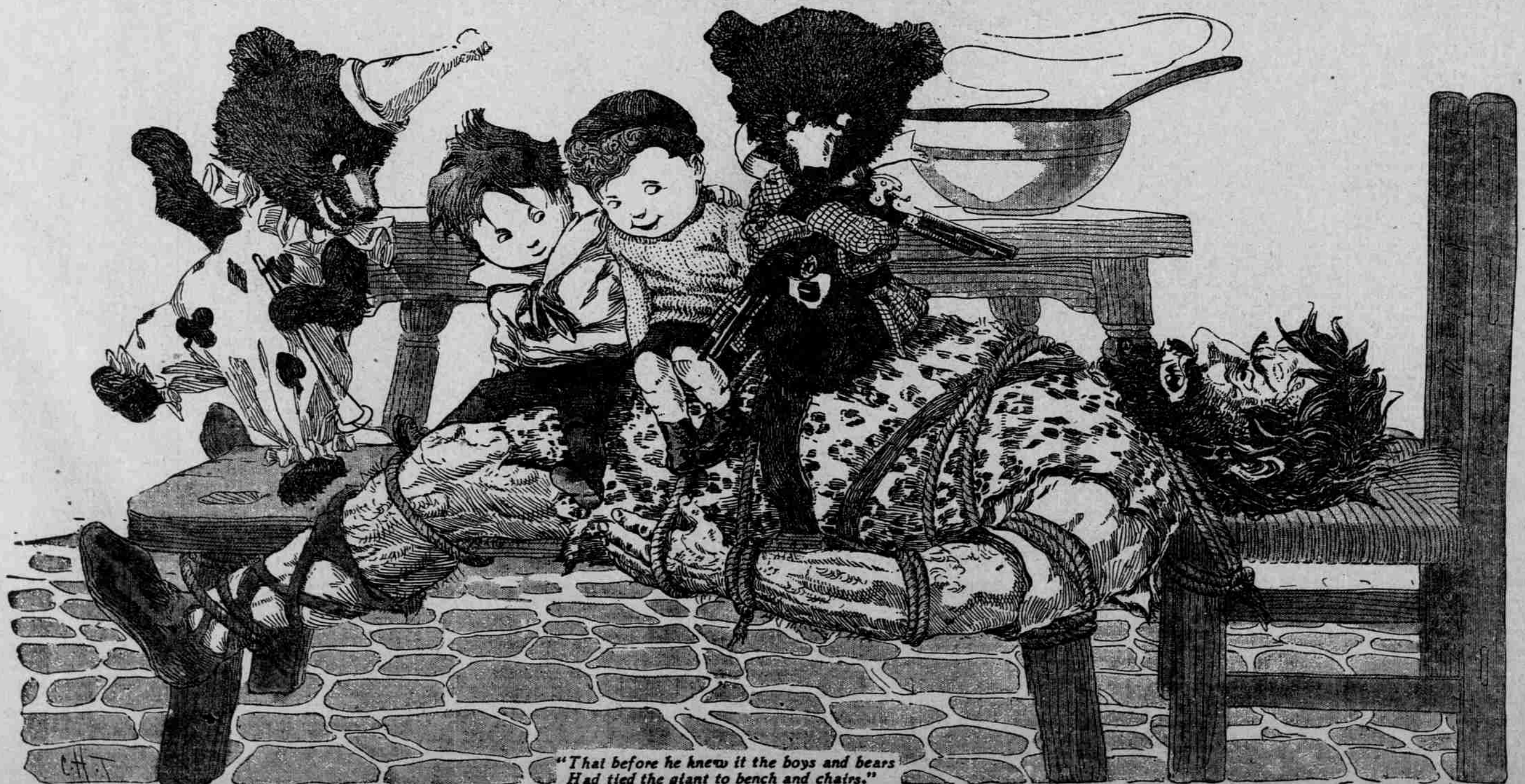
"That before he knew it the boys and bears Had tied the giant to bench and chairs."

What happened after has not been told, Except that the goose laid an egg of gold For Jack and his mother every day, And the beanstalk tree was cut away, And nobody ever heard again Of the giant who roasted boys and men.