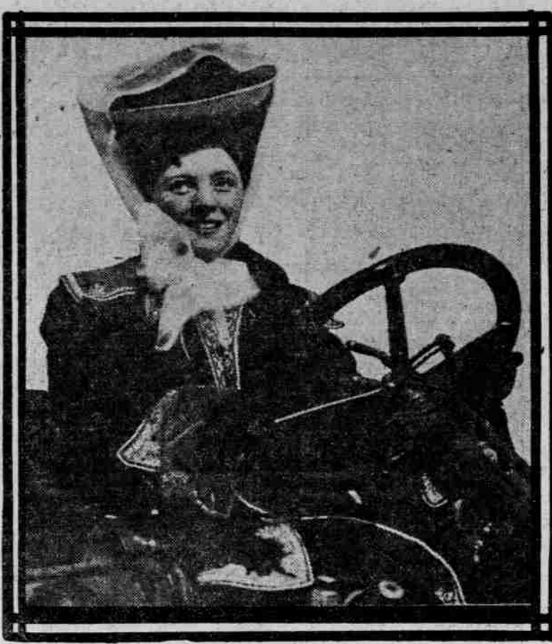
MABEL TALIAFERRO, WHO STARS IN "POLLY OF THE CIRCUS"