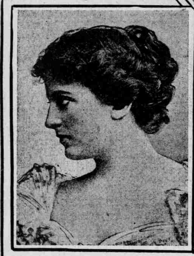
MAXINE ELLIOTT, WHO IS STARRING IN "UNDER THE GREENWOOD TREE"