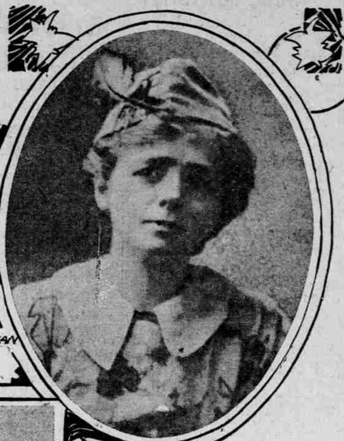
MAUDE ADAMS, WHO IS PLAYING "PETER PAN"