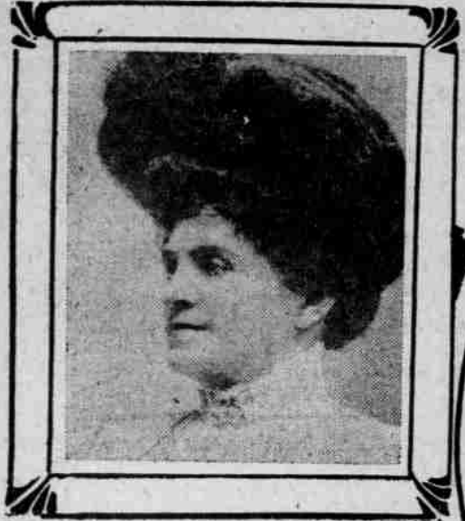
MADAME SEMBRICH, WHO SANG THE ROLE OF ROSINA, AT THE METROPOLITAN

JAMES K. HACKETT, MAXINE ELLIOTT, MABEL TALIAFERRO APPEAR IN NEW DRAMAS AT THE METROPOLIS