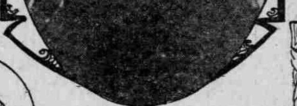
MISS EVA EARL FRENCH IN "A CHILD OF THE SLUMS" AT THE STAR