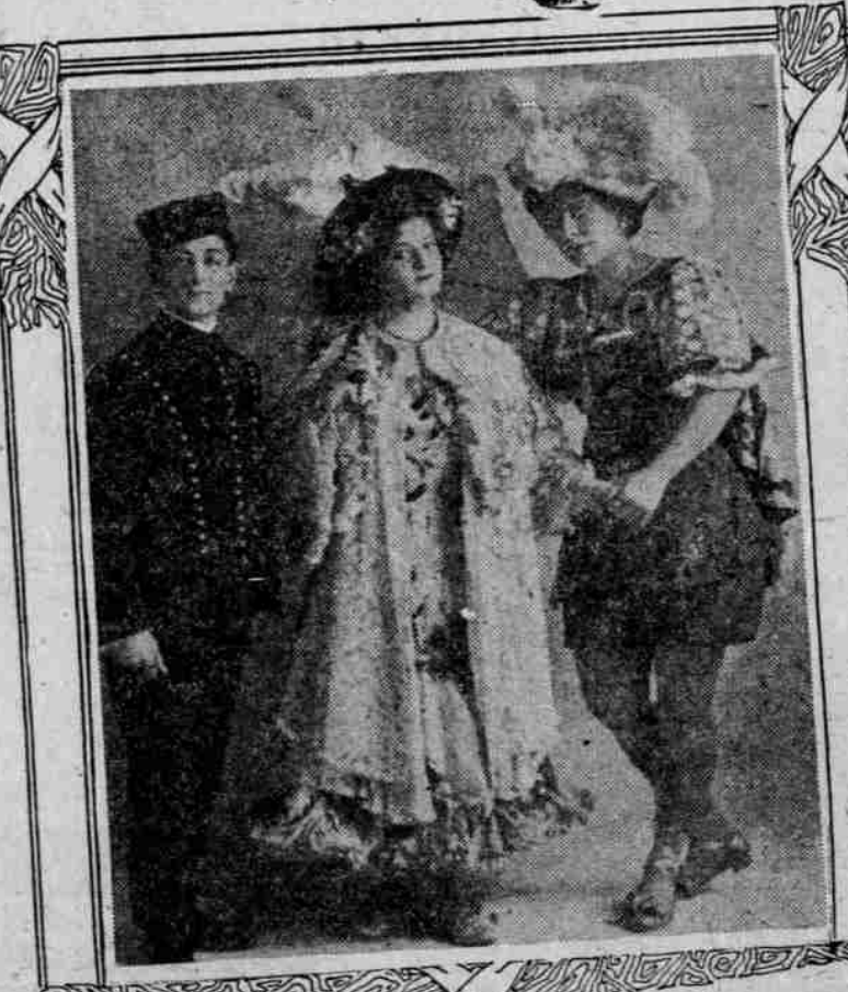
THE VELDE TRIO IN THEIR EQUILIBRIAL, ACROBATIC COMBINATION INCLUDING LOOP THE LOOP DOGS AT FANTASIES

LOCAL theatergoers have an interesting week in prospect, the bright particular event being the engagement of James T. Powers and the Shubert Company, in the musical play, "The Blue Moon."