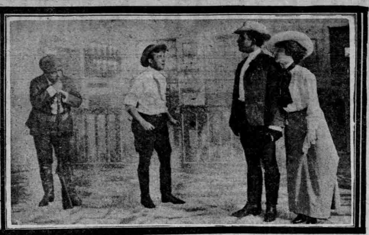
SCENE FROM "SOLDIERS OF FORTUNE" AT THE BAKER