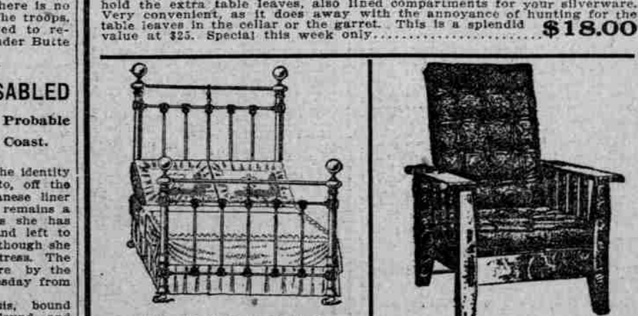
This Bed Only $5.50

NEW YORK, Jan. 4.—A new organization of theatrical men was completed in New York yesterday, known as the National Association of Theatrical Producing Managers. More than 200 members have already been enrolled. The association is formed for the purpose of enabling the managers to work together for the good of all in such matters as legislation regarding railroad rates for theatrical companies, the copyright law and the better enforcement of contracts.