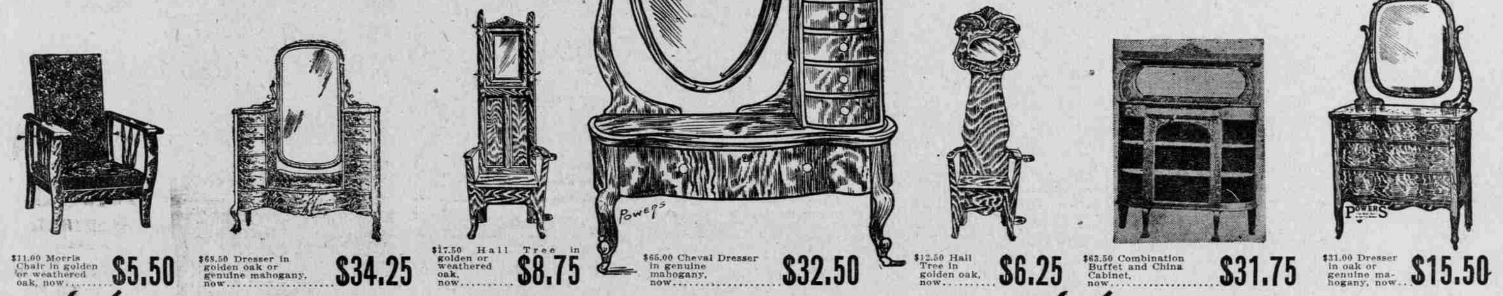
$11.00 Morris Chair in golden or weathered oak, now..... $5.50

DON'T WAIT—BUY NOW, WHILE THE CHOOSING IS GOOD; A DOLLAR IS WORTH TWO AT OUR STORE