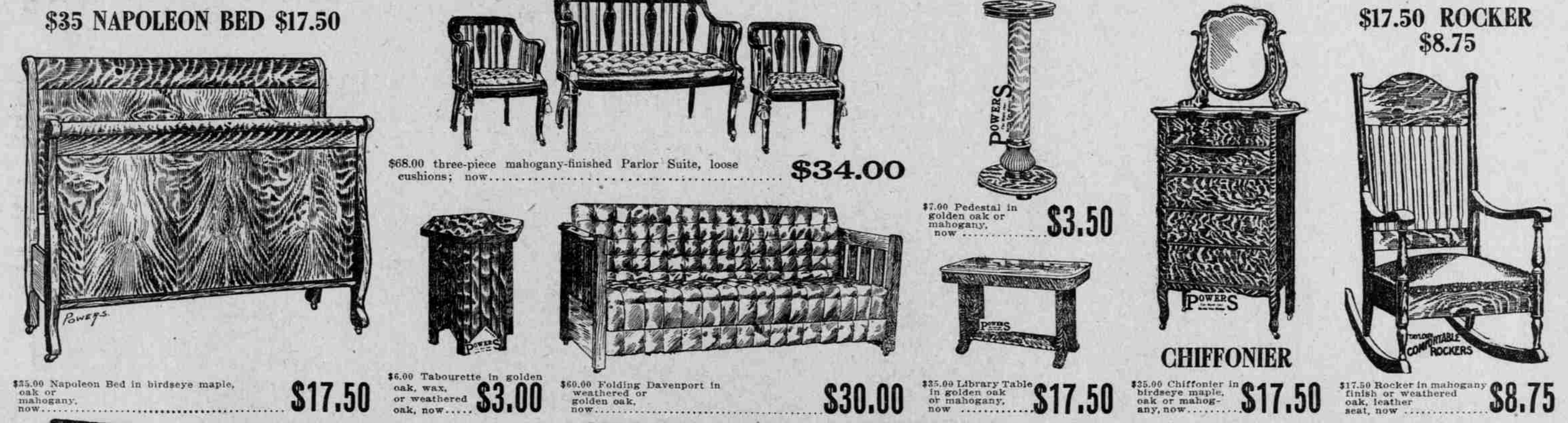
$35 NAPOLEON BED $17.50