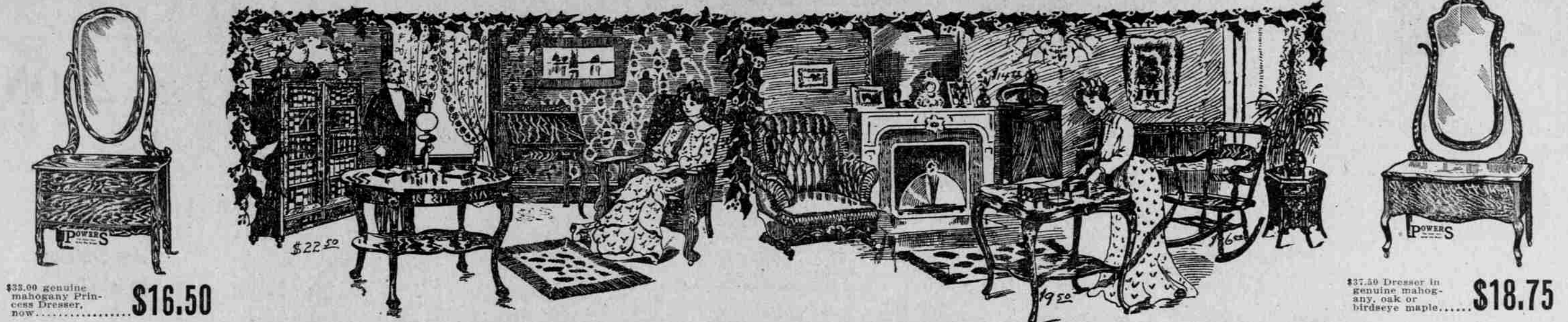
$35.00 genuine mahogany Princess Dresser, now..... $16.50