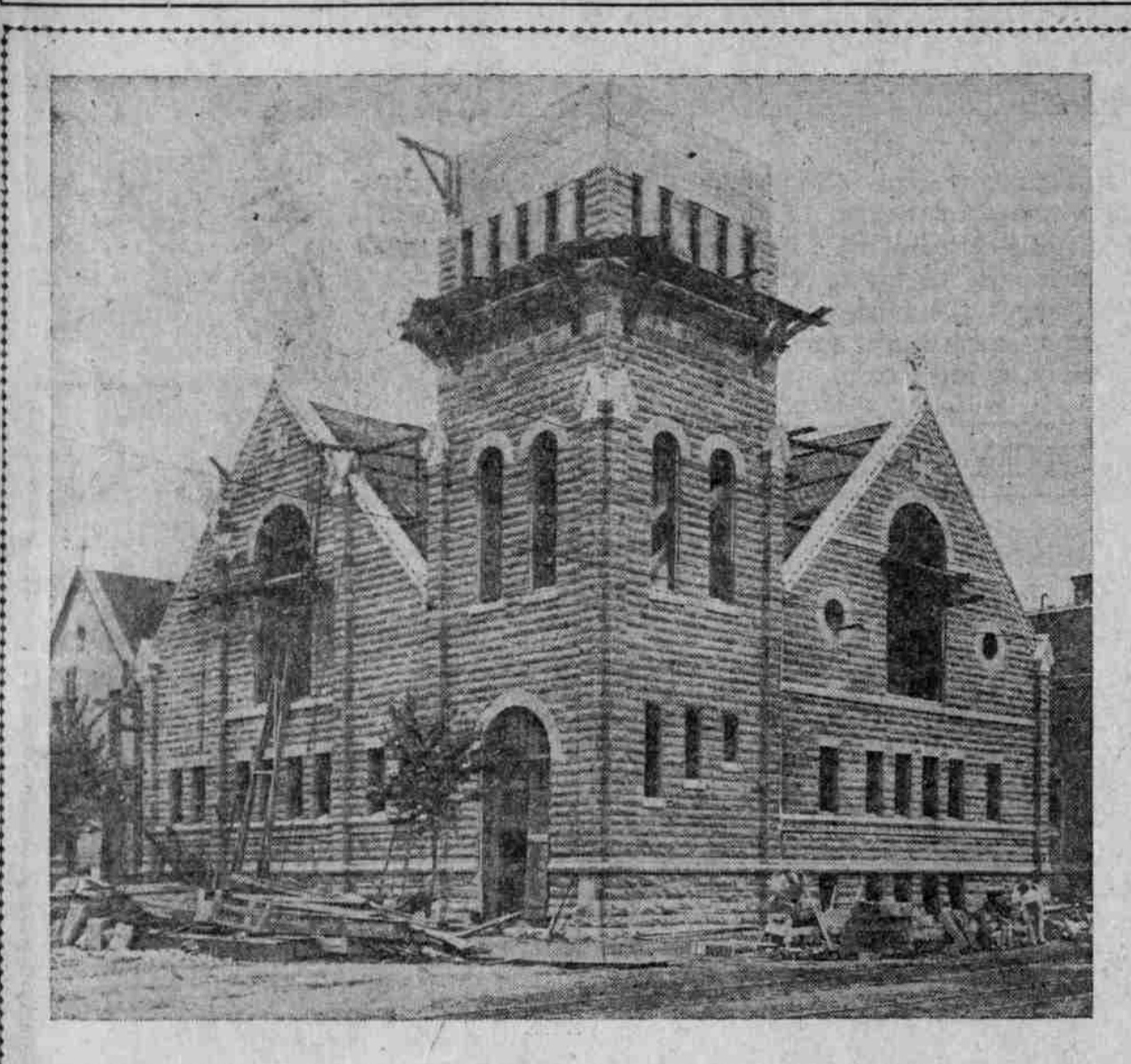
THE NEW ST. JAMES ENGLISH LUTHERAN CHURCH, CORNER WEST PARK AND JEFFERSON STREETS.