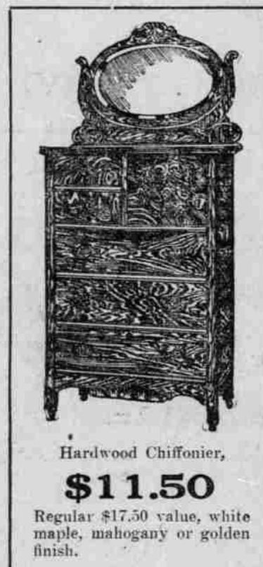
Hardwood Chiffonier, $11.50 Regular $17.50 value, white maple, mahogany or golden finish.

THE GREATEST FURNITURE PRICE-LIST EVER PRINTED. THESE SPECIALS TOTALLY ECLIPSE PREVIOUS OFFERINGS. The accompanying letter explains our position. We must move our immense warehouse stock and we fully appreciate the fact that a move on such short notice means a great sacrifice. The people of Portland and vicinity will never again see such prices. GUARANTEE--THE POWERS STORE positively guarantees that every article advertised will be sold and every article is as represented