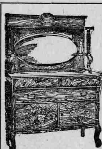
A Sideboard for $14.75

Oval French bevel mirror, golden finish.