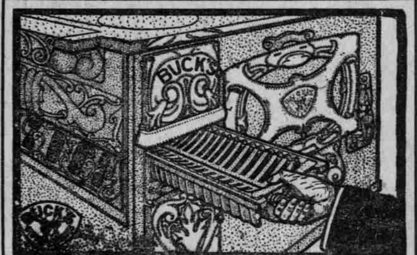
-this duplex grate will reduce your fuel expenses

—we will accept your old stove or range in exchange and for which we will give liberal allowance.