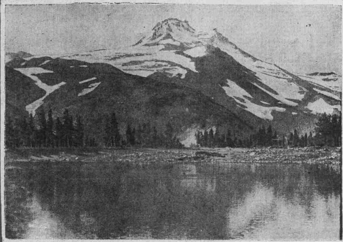
MT. JEFFERSON FROM THE HANGING VALLEY