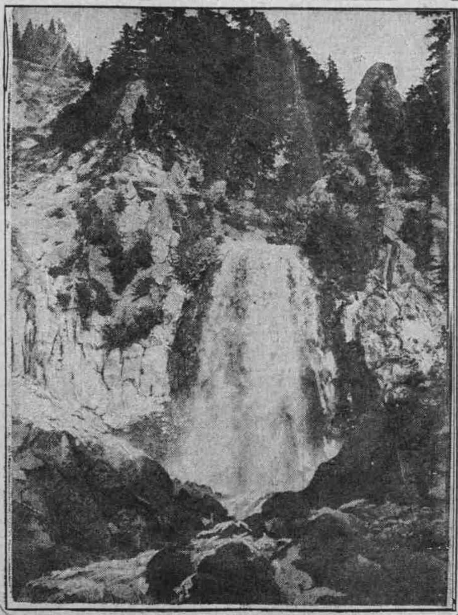
UNNAMED WATERFALL AT WEST END OF HANGING VALLEY