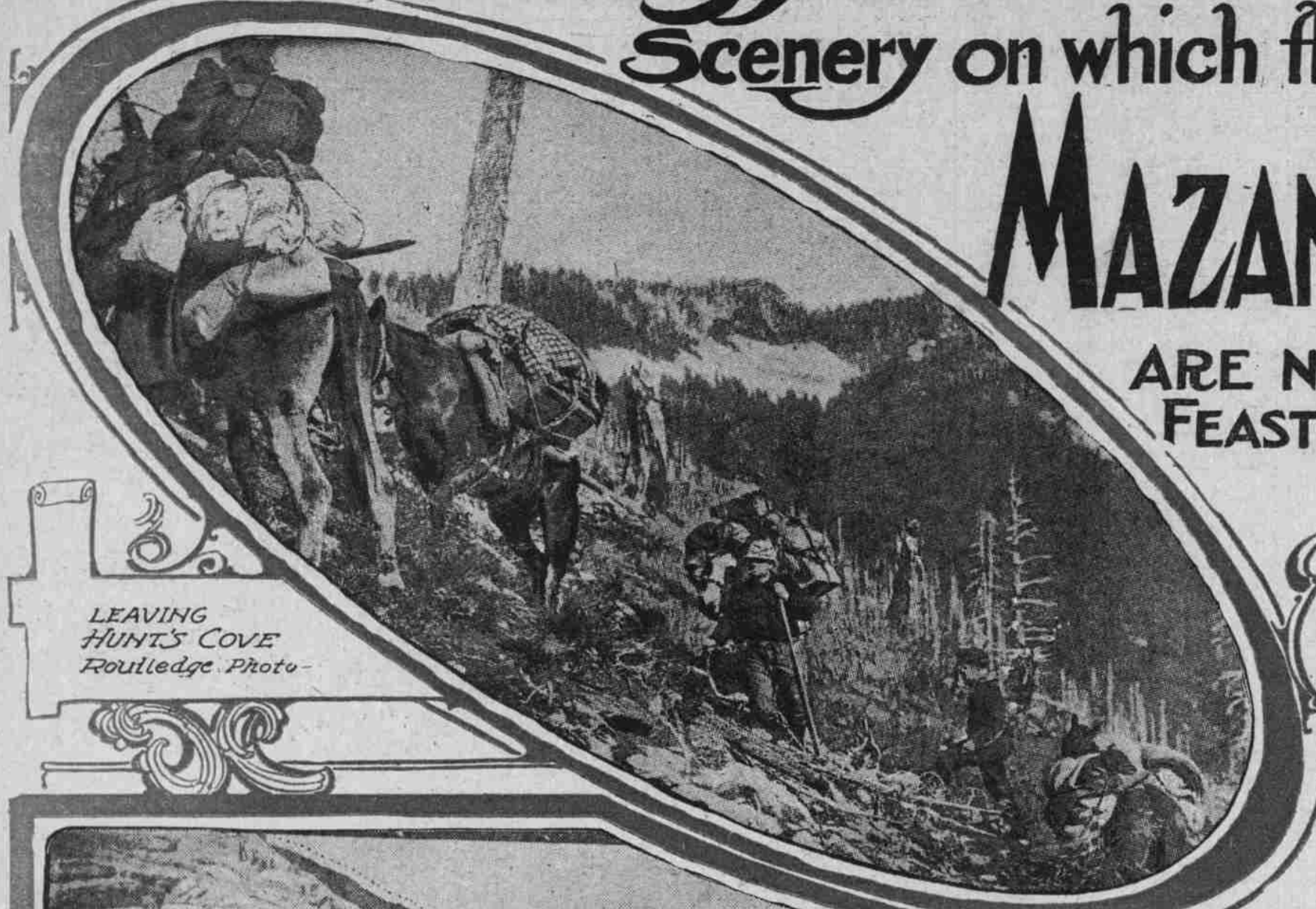
LEAVING HUNT'S COVE