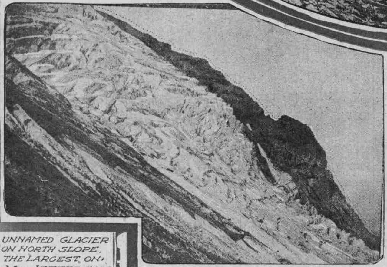
UNNAMED GLACIER ON NORTH SLOPE, THE LARGEST ON MT. JEFFERSON Dotted Line Shows Route of Ascent