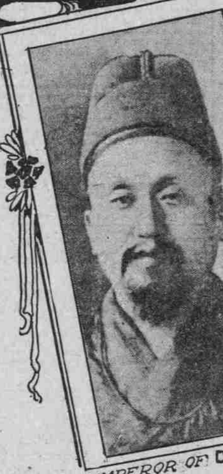
EMPEROR OF COREA

Machine Guns Guard Palace. A proclamation was published at 5 o'clock this evening warning the people