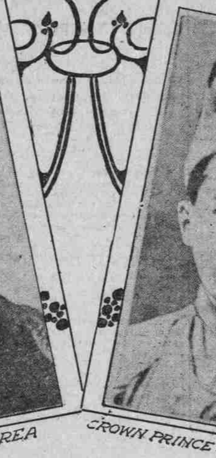
CROWN PRINCE OF COREA

to remain in their houses. At dusk, machine guns were entrenched behind 'bread-works' built in the streets approaching the palace, in anticipation of a night attack.