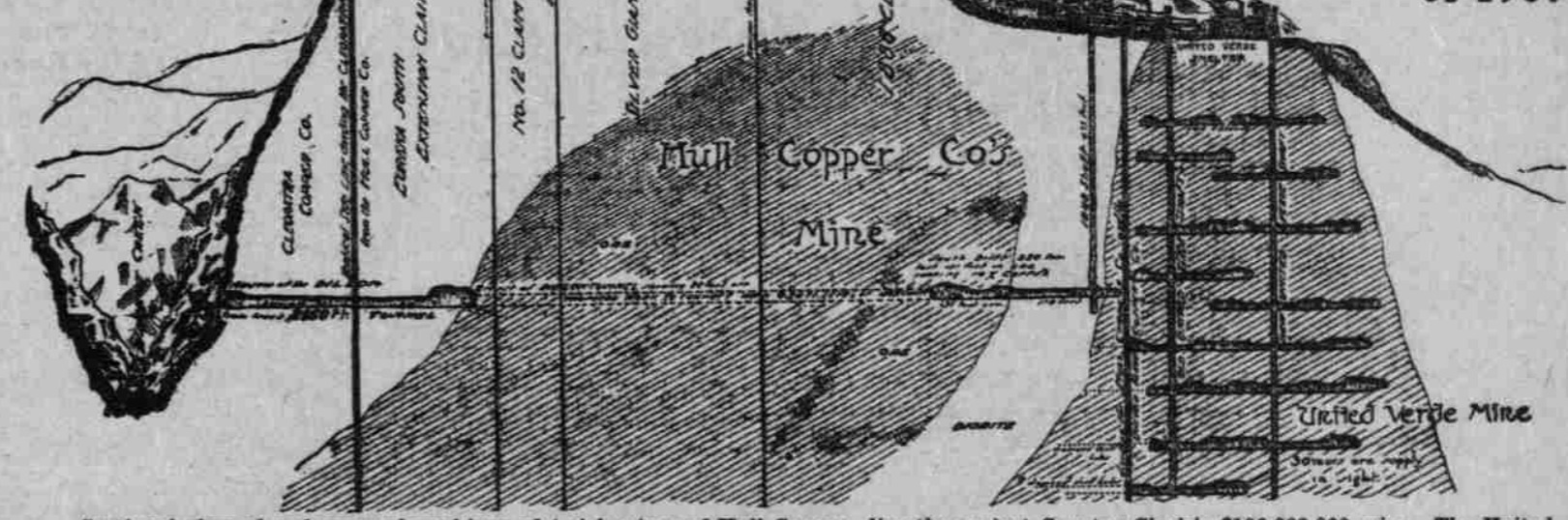
Sectional view of underground workings of 4 rich mines of Hull Copper, directly against Senator Clark's $100,000,000 mine—the United Verde. Notice enormous ore reserves and actual developments.

"Proven to contain one of the largest deposits of copper ore in the world." —Prescott Journal-Miner. "The proposition seems to be presented fairly upon its merits." —The Mining Investor.