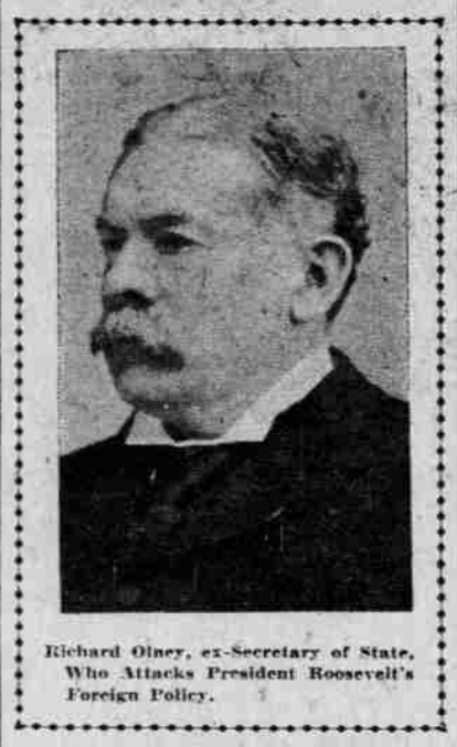
Richard Olney, ex-Secretary of State, Who Attacks President Roosevelt's Foreign Policy.

er and Haywood, the officials of the Western Federation of Miners, who are awaiting trial in Idaho on a charge of murder.