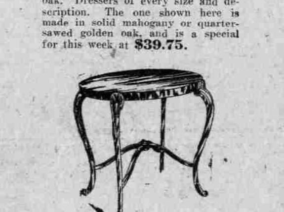
Center Tables: This table is made in quarter-sawn golden oak or genuine mahogany; is offered this week only at $9.75.