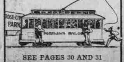
SEE PAGES 30 AND 31