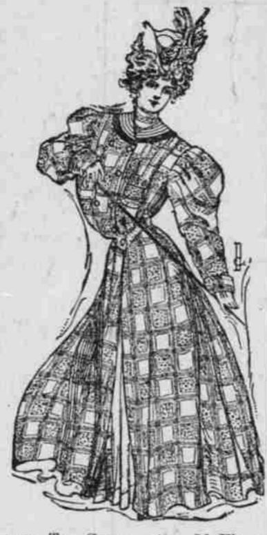
New Dress and School Apparel for misses and children; 2d Fl. New Waists, new Petticoats, new Tea Gowns, etc. 2d Floor.

New Spring Coats in short, medium and long styles, loose and tight-fitting effects, in all the very newest materials—fancy tweeds, worsteds, cloths and broadcloths; large assortment. New Walking Skirts on sale at prices from $5.00 to $35.00 each. New Black Voile Dress Skirts, with silk drapes—all low priced. New Party and Summer Dresses, made of dainty wash materials. The new Shirtwaist Suits are now receiving their first showing. New "Peter Thompson" Suits and Coats, on sale in all sizes.