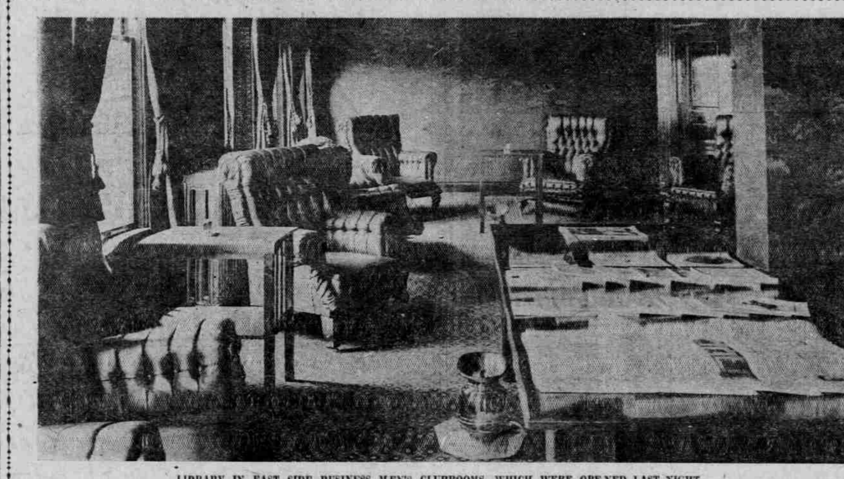
LIBRARY IN EAST SIDE BUSINESS MEN'S CLUBROOMS, WHICH WERE OPENED LAST NIGHT.

PARFUMERIE ED. PINAUD, Paris, France. What do I think of ED. PINAUD'S EAU DE QUININE? For me, after having used it, it is the queen of the hair tonics.