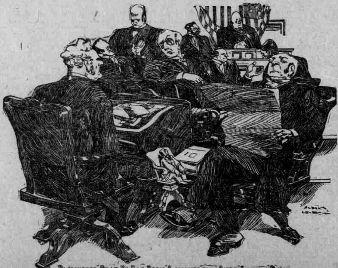
DISCOVERED THAT HE HAD BEEN ASSIGNED TO A CUTE LITTLE DESK