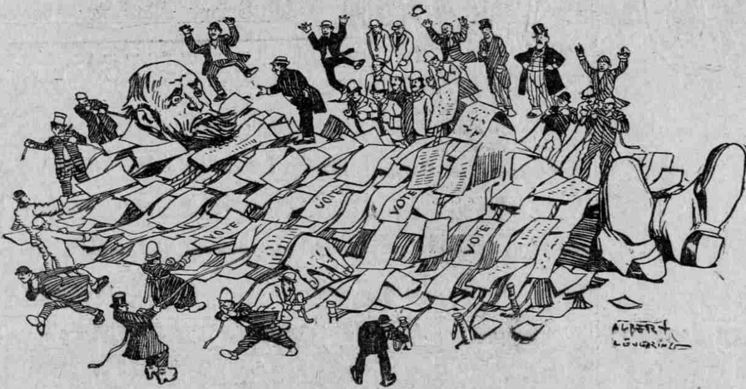
HE FOUND OUT THAT HE WAS TIED HAND AND FOOT

He continued to live among the Lilliputs and he was always a Big Man, but never quite as big as before they sneaked up on him and showed him how to take a Joke.