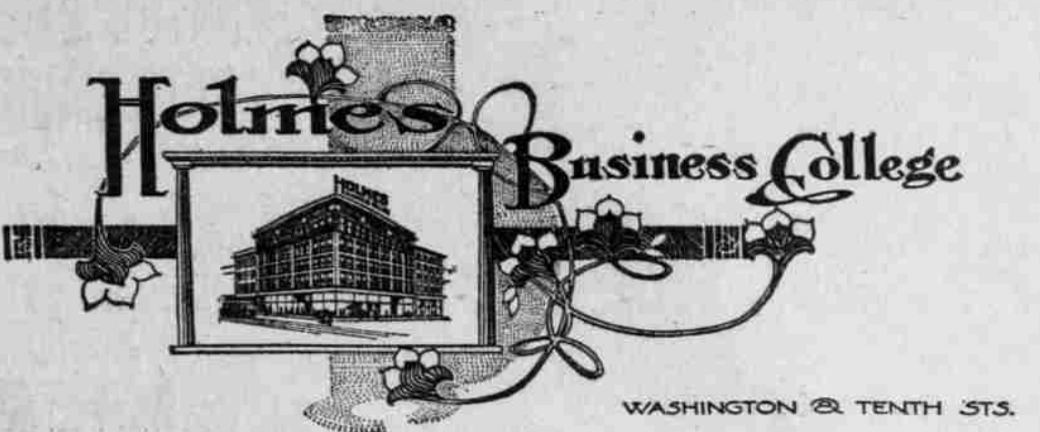
WASHINGTON & TENTH STS.