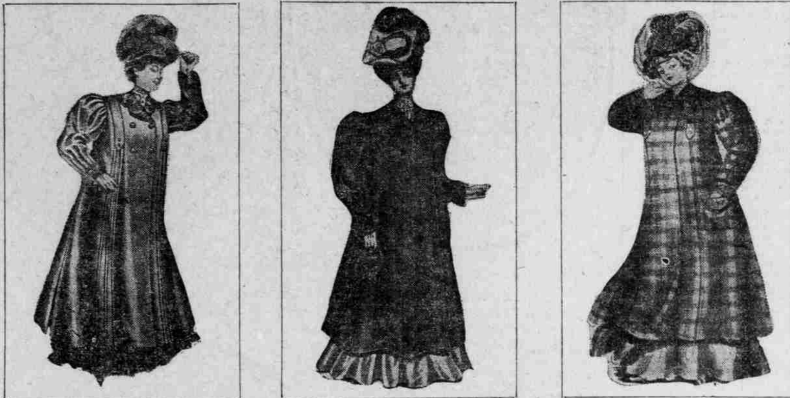
Semi-Fitting, Button Back Effect. Gray Color with Black Trimming. Very Stylish. On Display in Our Window