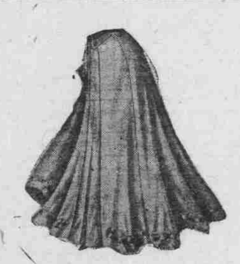
FOR MONDAY BUYERS

Lest You Forget-We are the only firm in Fortland equipped for manufacturing Ladies' Coats and Suits. We have expert factory employes, and garments purchased in our store will be handled expertly and with dispatch and absolute