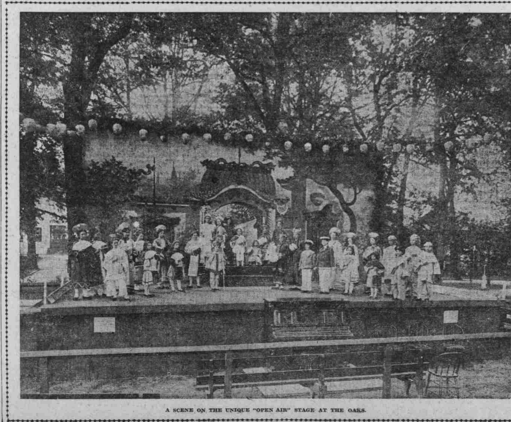
A SCENE ON THE UNIQUE "OPEN AIR" STAGE AT THE OAKS.