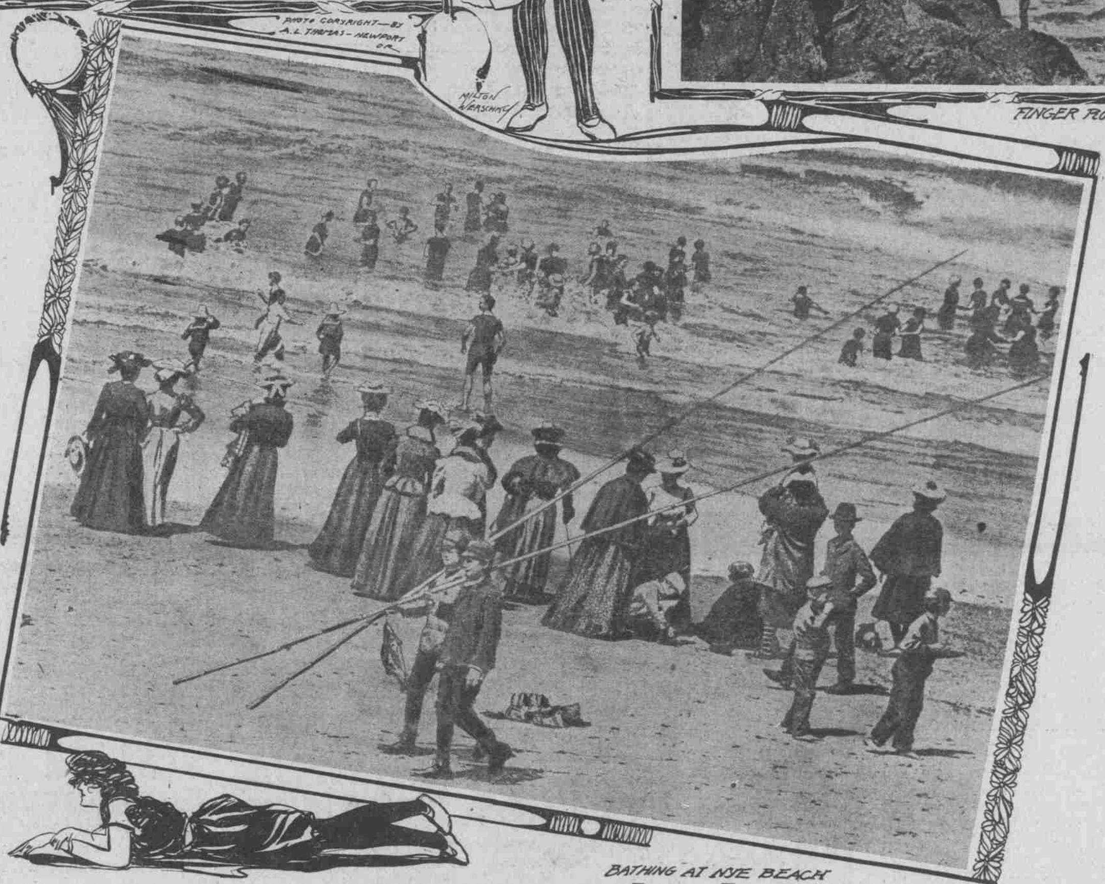
BATHING AT NIE BEACH