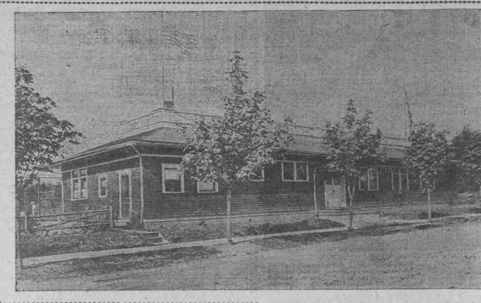
IRVINGTON TENNIS CLUBHOUSE AND COURTS WHICH WILL BE THE SCENE OF A TOURNAMENT THIS WEEK.