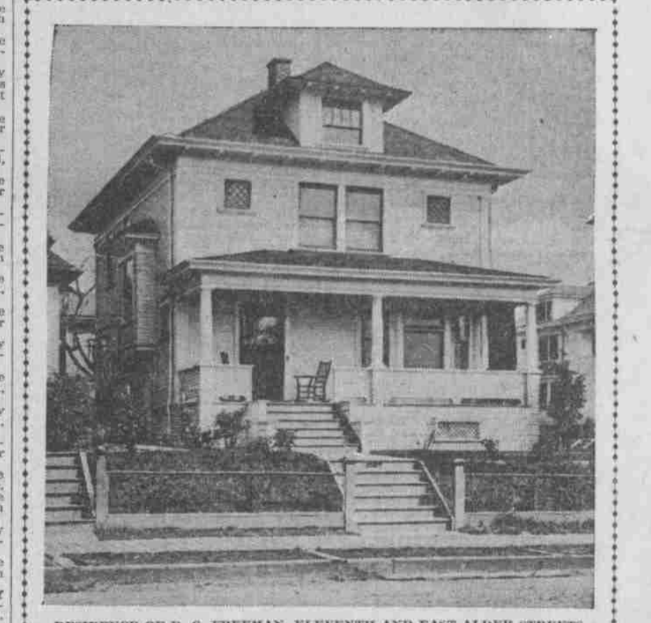
RESIDENCE OF D. C. FREEMAN, ELEVENTH AND EAST ALDER STREETS.

dwelling on East Taylor street, between East Thirty-eighth and East Thirtieth; $1500.