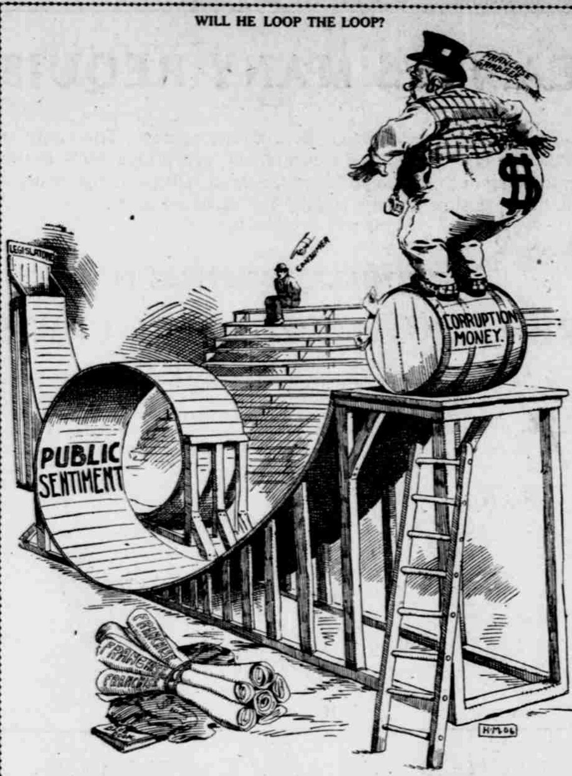
WILL HE LOOP THE LOOP?

A new day for the Pacific is dawning; assured the completion of the isthmian canal and the open door in Asia, for both of which all patriotic stand—every part of our shore will be needed for its commerce. Therefore, there should be no delay in completing the improvements at