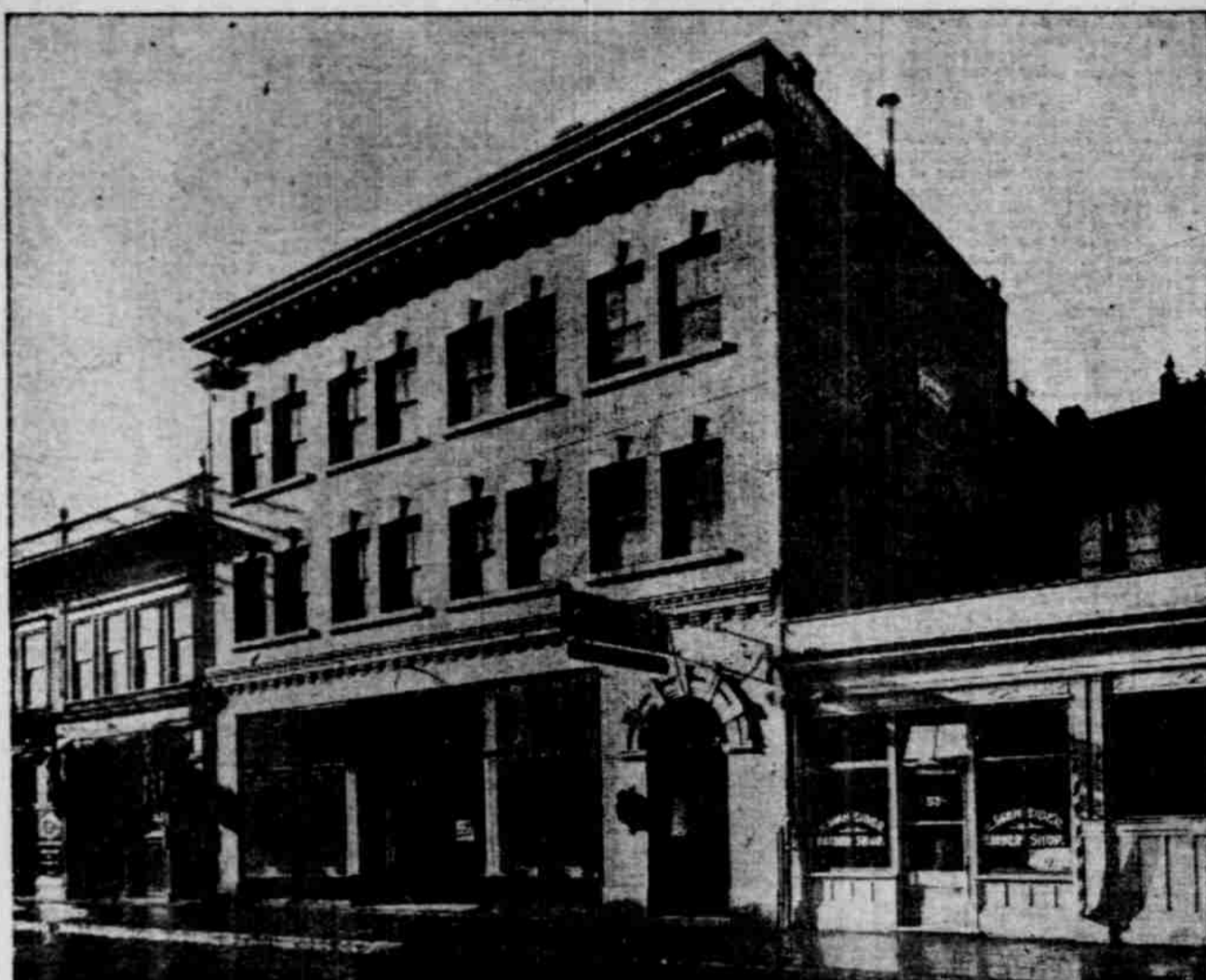
B. W. WALLACE BUILDING, SIXTH STREET, BETWEEN COUCH AND DAVIS.