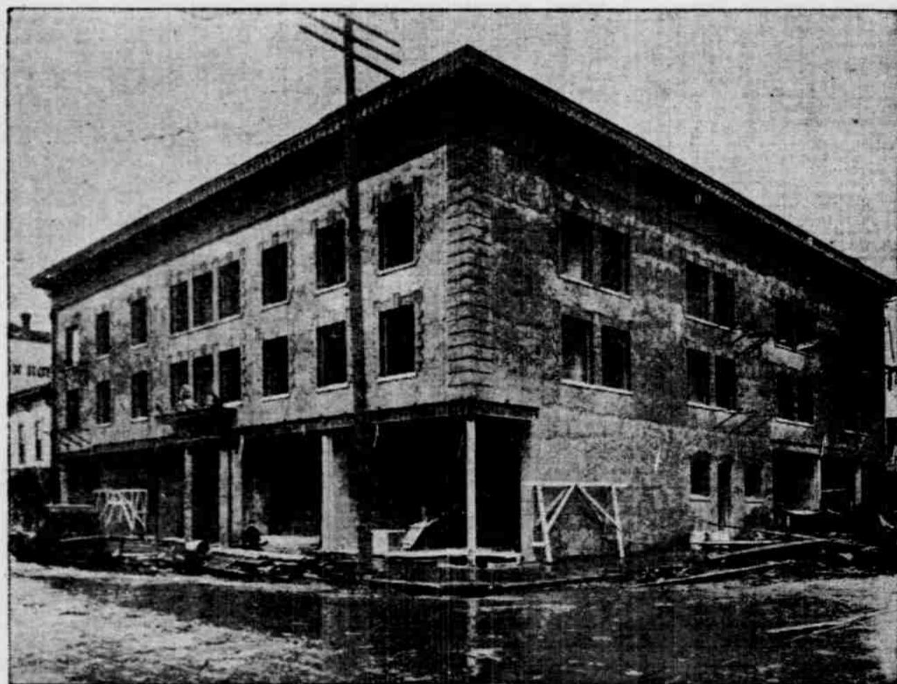
SIXTH AND EVERETT STREETS.