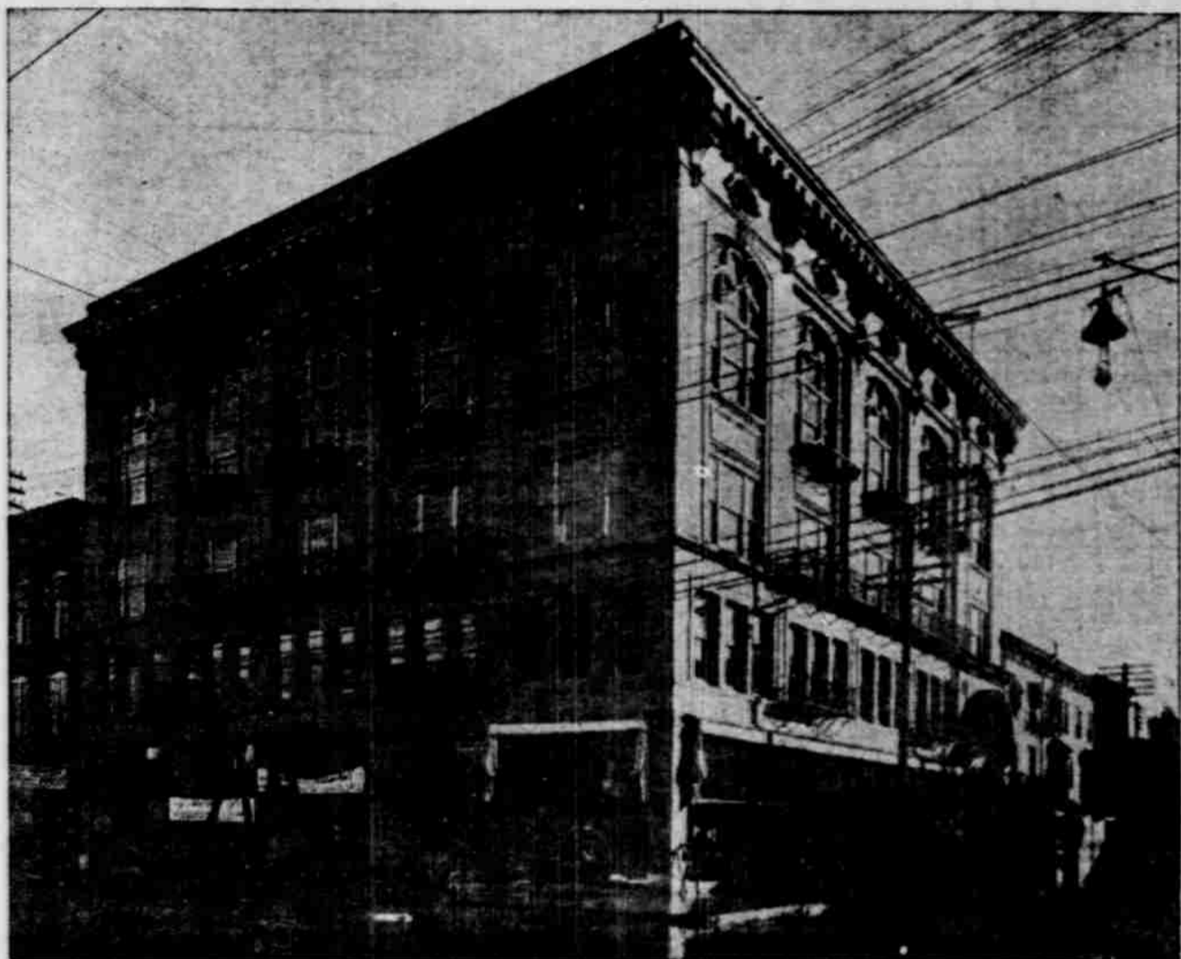
ELKS' BUILDING, SEVENTH AND STARK STREETS.

MANY IMPORTANT SALES ARE REPORTED AND OWNERS REALIZE LARGE PROFITS