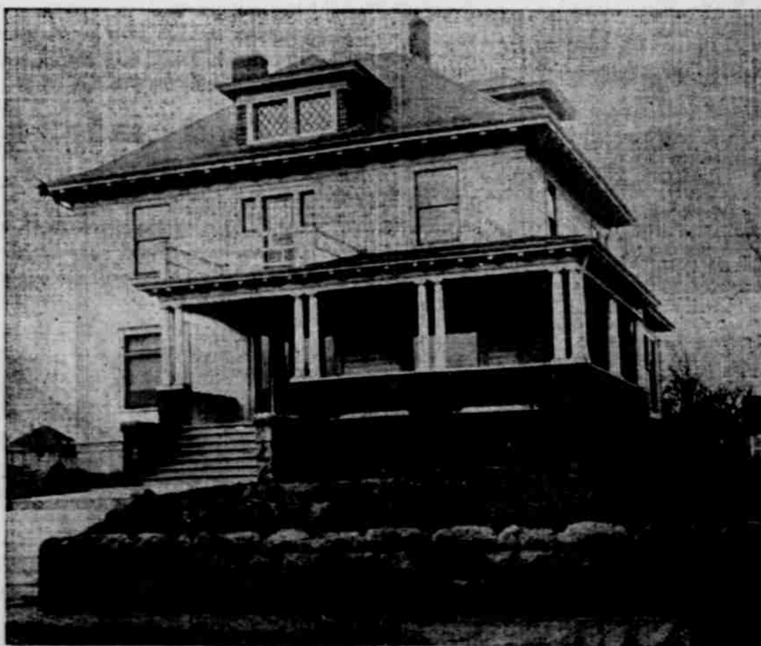
NEW RESIDENCE OF C. A. BALL AT FOURTEENTH AND EAST WASHINGTON.

The residence of C. A. Ball, at East Fourteenth and East Washington streets, shown in the above picture, is one of the most beautiful and modern of the new homes on the East Side. The library, parlor, dining-room, staircase and hall are finished in golden oak. The kitchen and spare rooms are finished in natural fir. The bathroom is in enameled white and nickel. The house was designed by E. E. McClure.