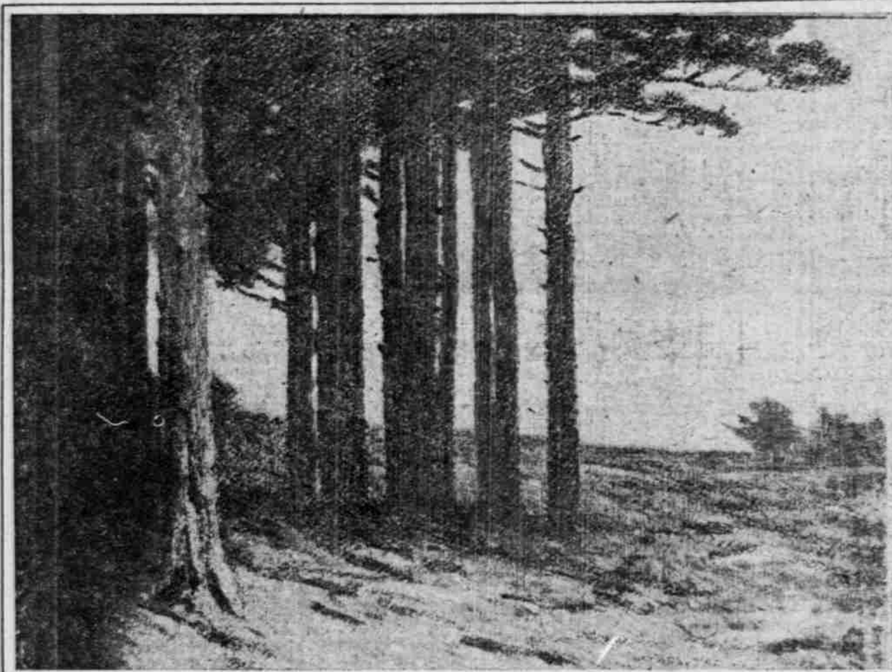
270 FOREST OF PINES — — CHAS. WARREN EACON —