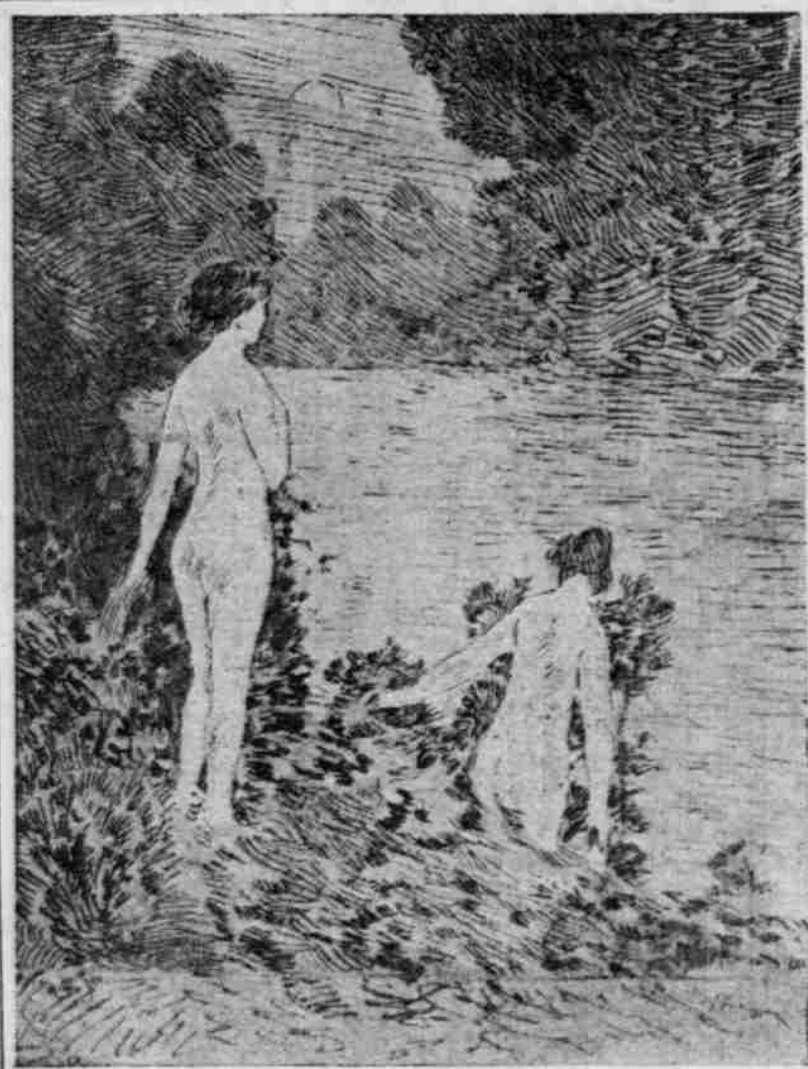
74 MOONRISE AT SUNSET — CHILDE HASSON —