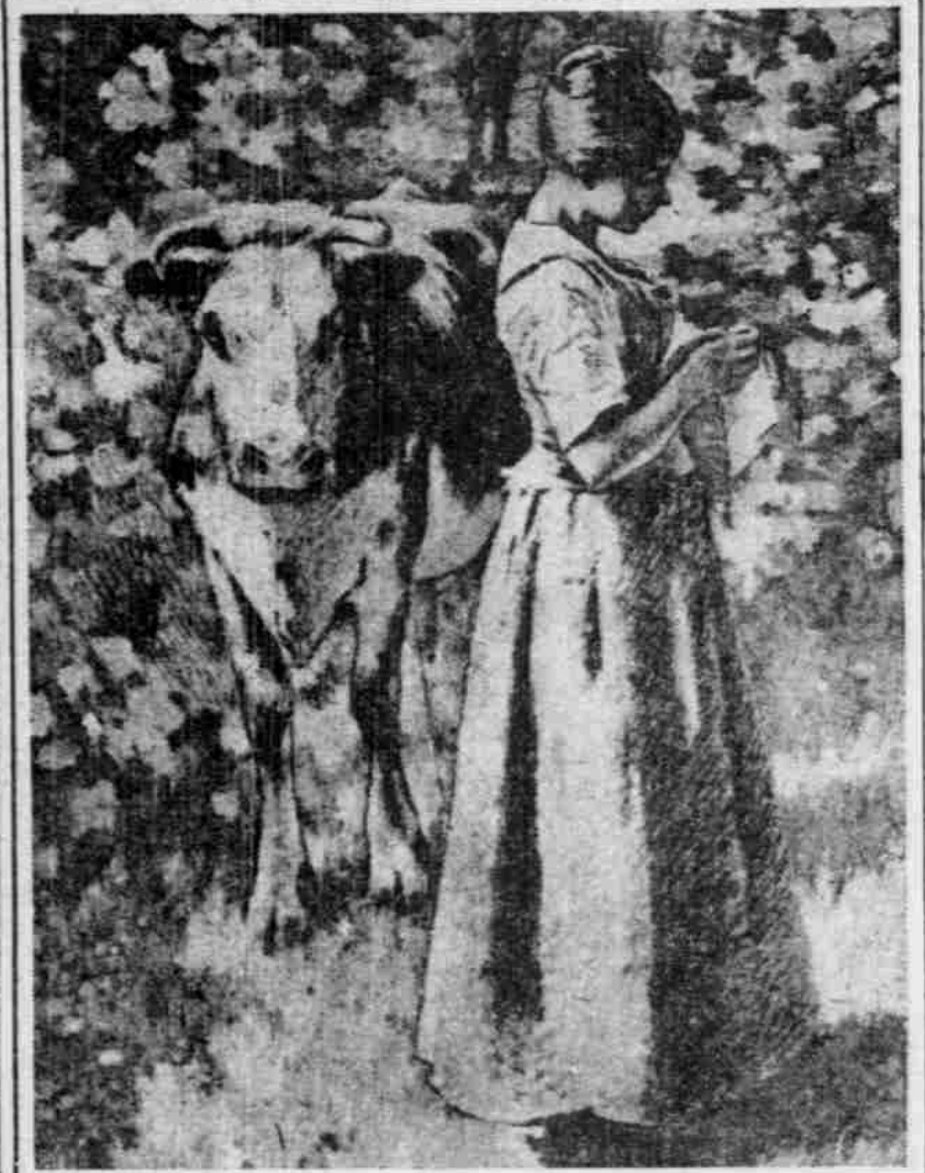
59 THE GIRL AND COW. — THEO. ROBINSON — LOANED BY S.S. DUFFIN —