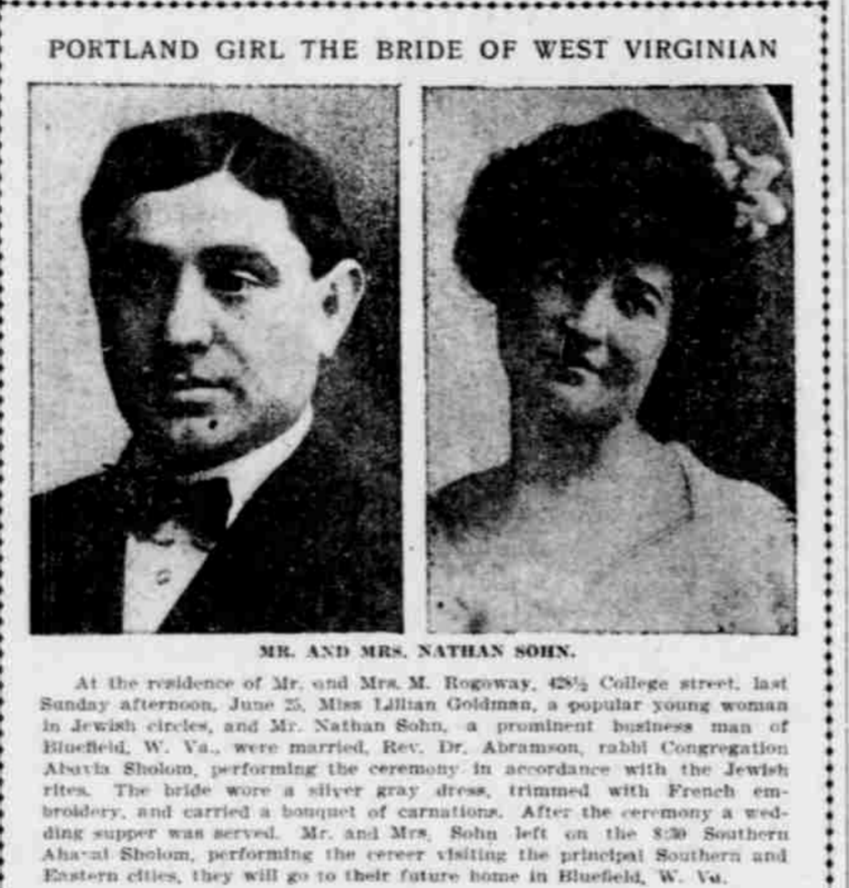
PORTLAND GIRL THE BRIDE OF WEST VIRGINIAN