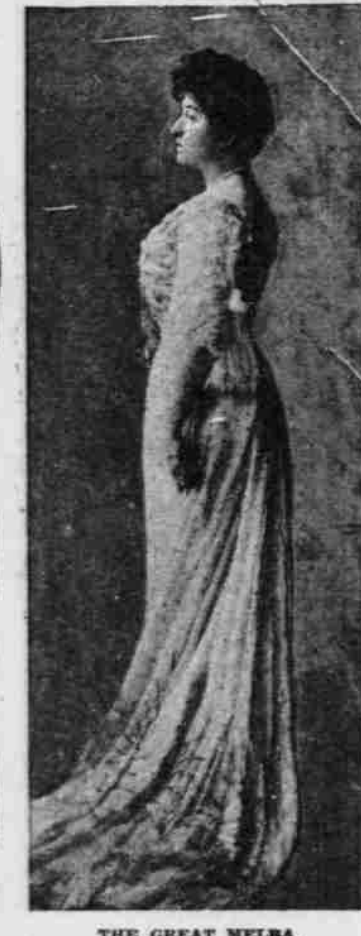
THE GREAT MELBA.