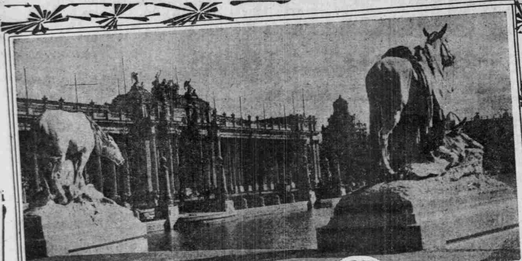
VIEW OF STATUARY LOOKING TOWARD PALACE OF EDUCATION

Statuary Costing $2,500,000 Will Adorn the Lewis and Clark Exposition Grounds