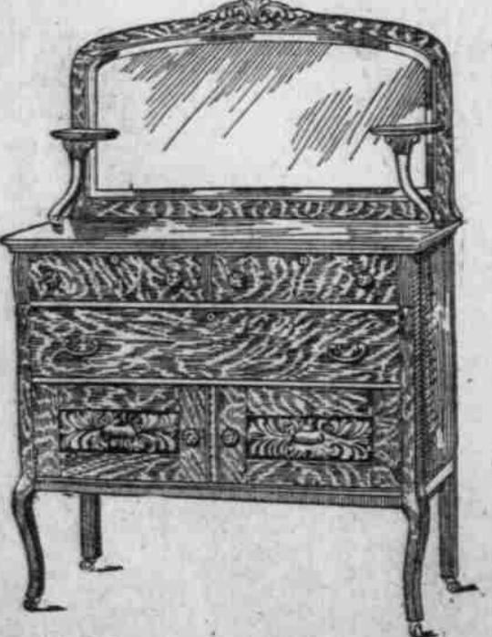
No. 130 Buffet—Full quartered oak. Double top, 20x45 inches. French beveled plate, 18x40 inches, one drawer lined, heavy cast brass pulls. Finish golden oak, highly rubbed and polished; special price.....$25.00