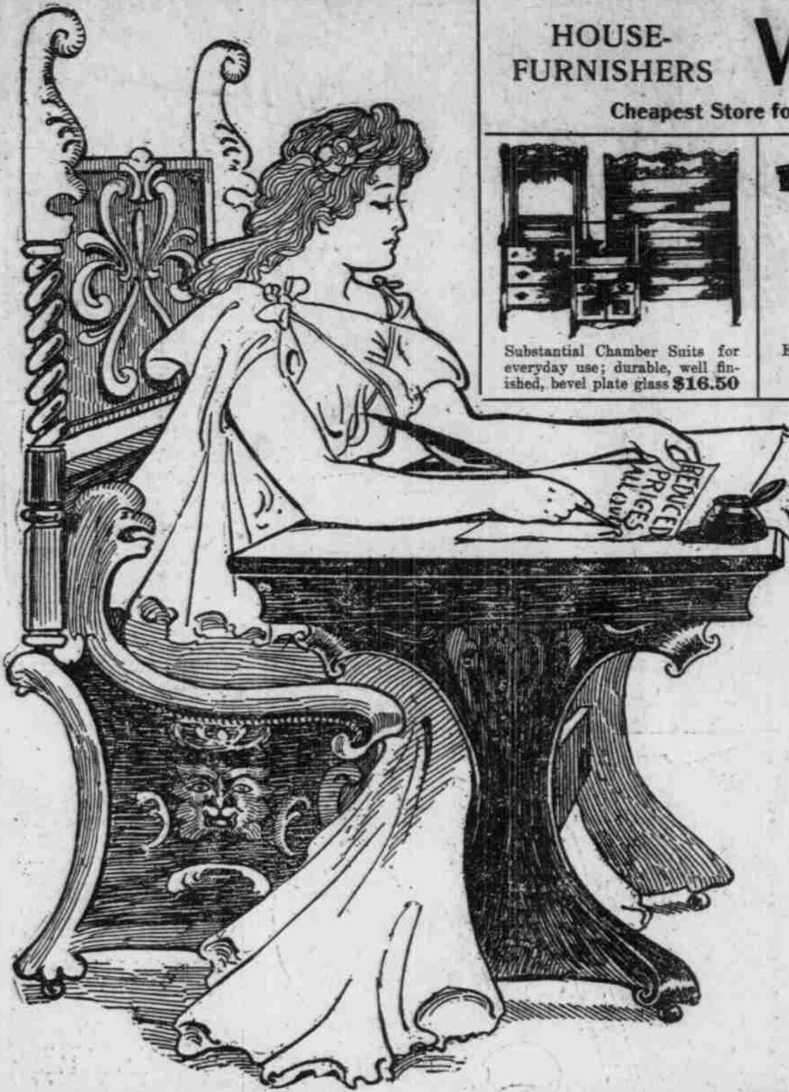
Substantial Chamber Suits for everyday use; durable, well finished, bevel plate glass $16.50