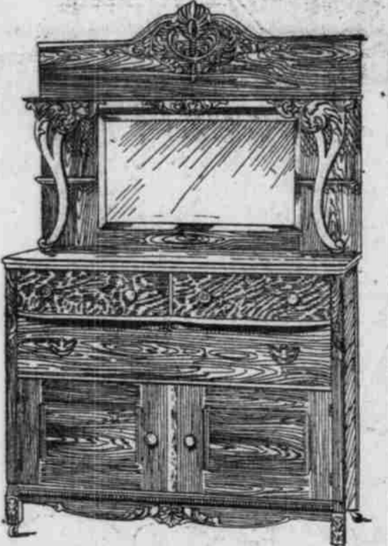
No. 170 Sideboard—Solid oak. Quartered oak top drawers, double-shaped top, 24x50 inches. French beveled plate 18x32 inches, one drawer lined, cast brass pulls. Golden oak, gloss finish; special price.....$25.00

RELIABLE RANGE, with high closet and duplex grate, spring balanced oven doors. This is a heavy, substantial and durable range, made of best quality cold-rolled steel; adapted for coal or wood; oven thoroughly braced and bolted; asbestos lined throughout; elaborately nickel trimmed; section plate top. Orders from country must be for cash; parties in town can buy one for $5 down and $5 per month. Price.....$27.50 If not satisfactory, money refunded.