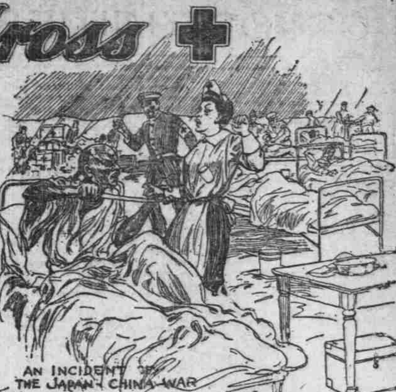
AN INCIDENT IN THE JAPAN-CHINA WAR

The Japanese Red Cross finds plenty of work to do even when the country is not at war. Japan is afflicted far more than most nations by great cal-