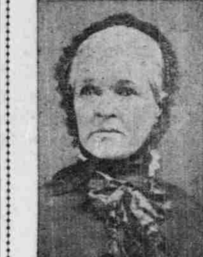
Venerable Pioneer of Yamhill County, Widow of Indian War Veteran.

seating capacity of 150 people, and two recitation-rooms. The remaining nine rooms will be for the use of the different grades. The High School will be located on the second floor. Each schoolroom will have semi-circular windows. There will be a principal's office, another for the library, and closets for wraps and lunches. In the basement there will be boys' and girls' playrooms, lunchrooms, etc. The latest devices in ventilation and sanitation have been carefully provided for, and the structure, as a whole, will be the finest school building in Southern Oregon.