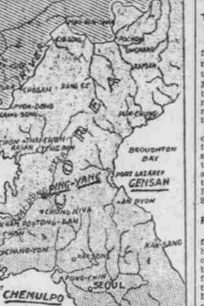
THEATER OF OPERATIONS IN KOREA. JAPANESE FLEET ENROUTE TO THE YALU RIVER AND MUKDEN, CAPITAL OF MANCHURIA.