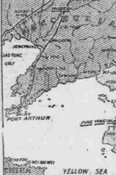
THEATER OF OPERATIONS IN KOREA. JAPANESE FLEET ENROUTE TO THE YALU RIVER AND MUKDEN, CAPITAL OF MANCHURIA.