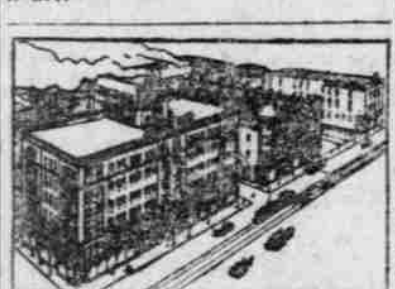
The Pe-ru-na Buildings.

How do the malaria germs find their way into the system? "They enter with the food, water and air which we consume." "Enter where, doctor?" "Why they enter through the mucous membrane, of course—of the lungs, stomach or bowels." "Well, now are you perfectly sure doctor, that they would be able to enter through these membranes if they were perfectly healthy, or in other words, perfectly free from catarrh?" "I suppose, of course, that health would be a protection, if not an absolute barrier."